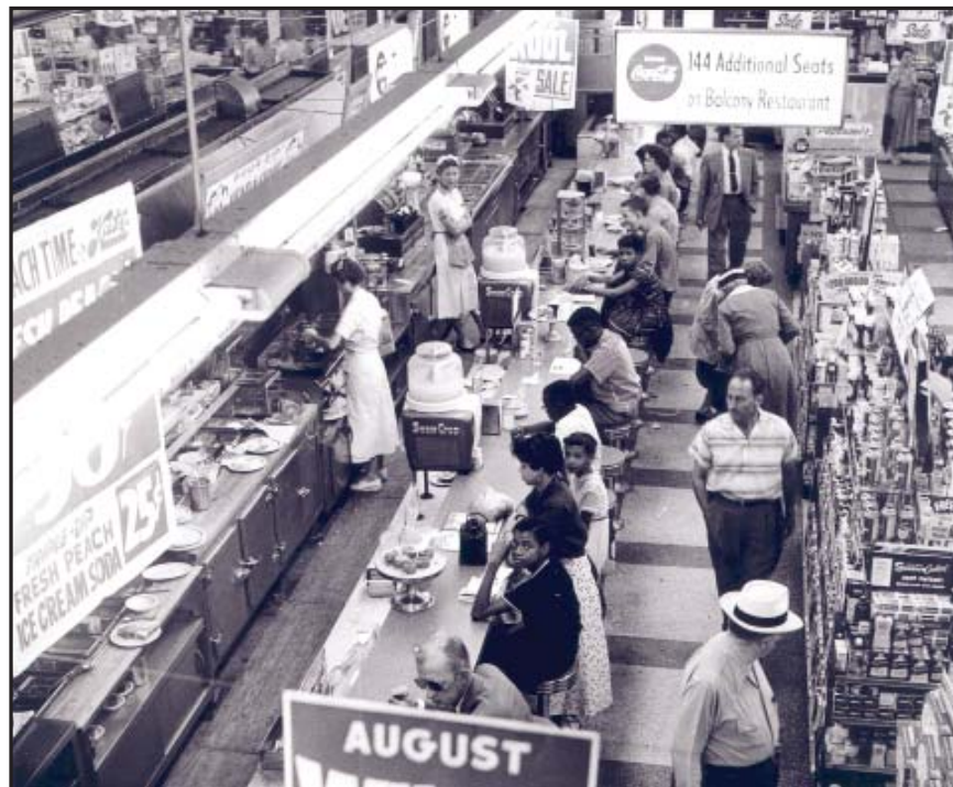
Above and below: Sit-in at lunch counter in Katz Drug Store, Oklahoma City, Oklahoma, August 26, 1958.