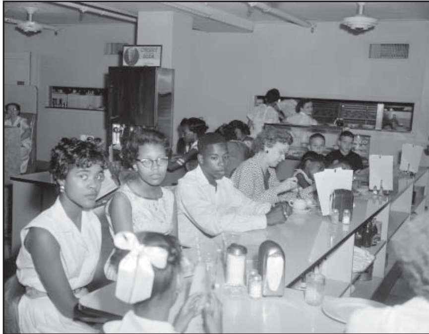
Civil rights sit-in at the John A. Brown Department Store.