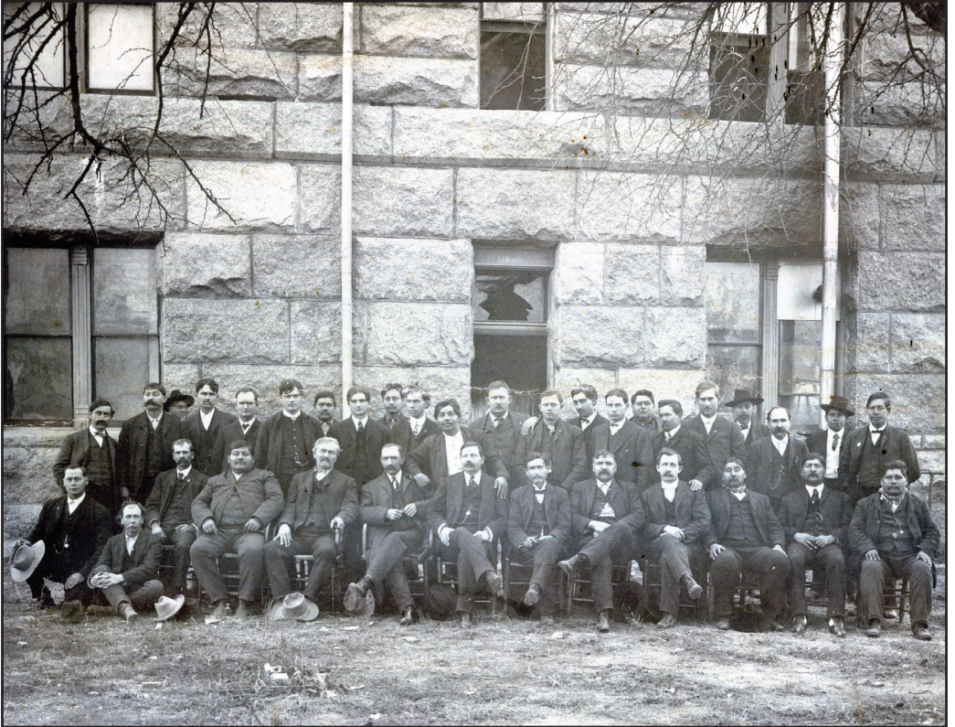
Members of the last Chickasaw Legislature, 1905-06.