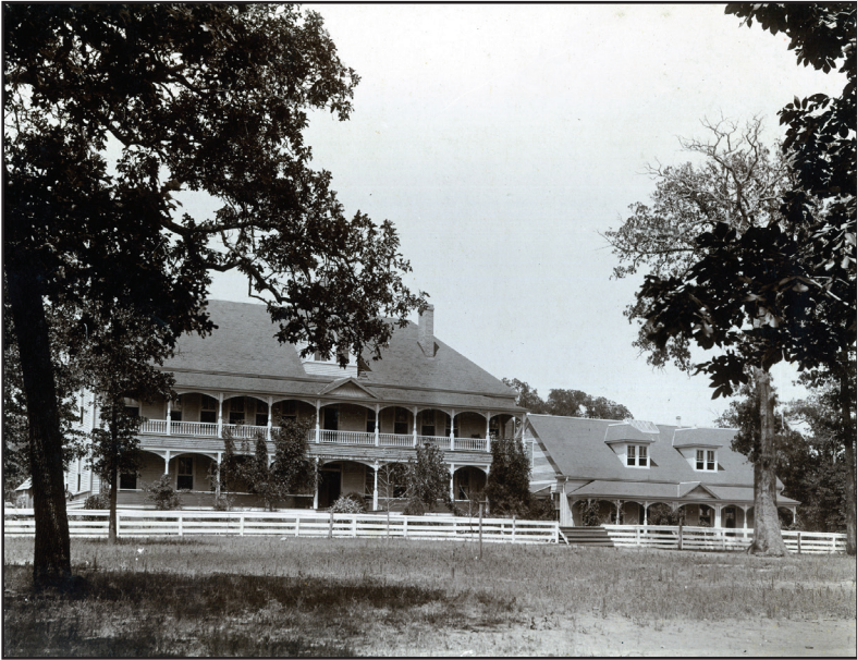
Above: The third building of the Bloomfield Academy, built in 1890 and burned in 1914.