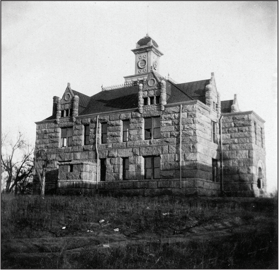
The Chickasaw Capitol Building, Tishomingo, c. 1900.