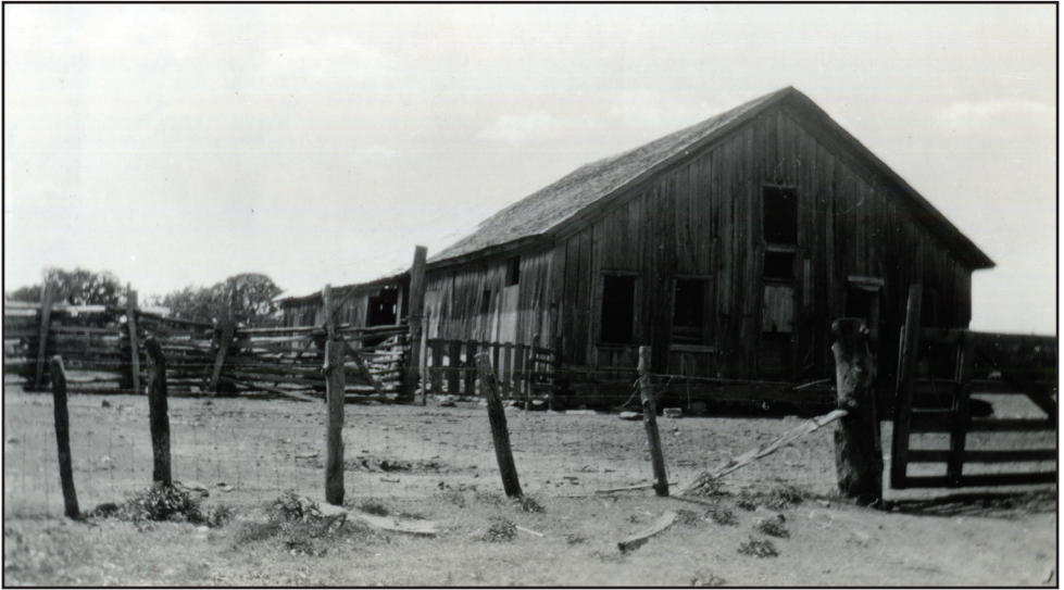
The commissary at Fort Arbuckle, 1934.

under proper tuition will act as a spur to their present sluggish and incompetent methods.” 17