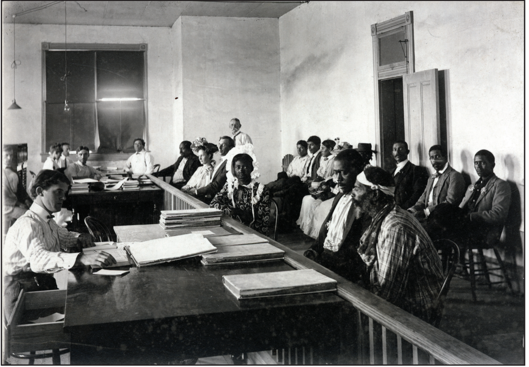
Chickasaw freedmen filing on allotments in Tishomingo (3759, W. P. Campbell Collection, OHS Research Division).