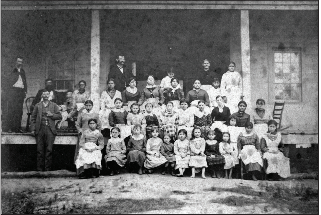
Students and faculty at the first building at Bloomfield Academy, c. 1880-84.