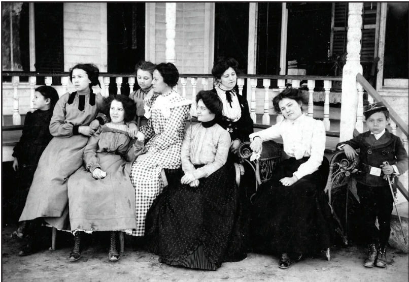
Below: Bloomfield girls and a little boy, c. 1900-14.