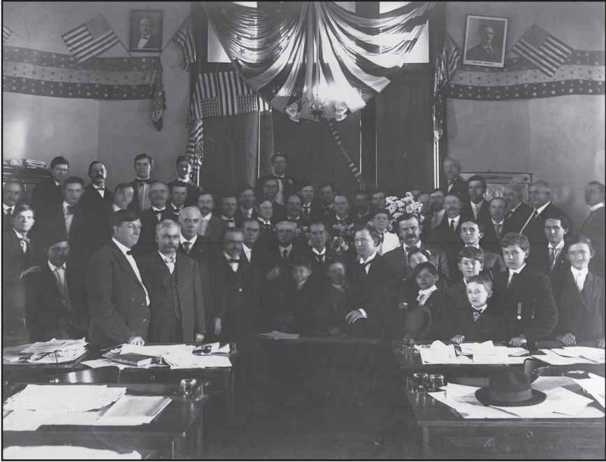
The signing of Senate Bill One, which was Oklahoma's first Jim Crow legislation, 1907

can Phoenix attempted to pin blame on blacks for this the week after the unsuccessful election, writing: