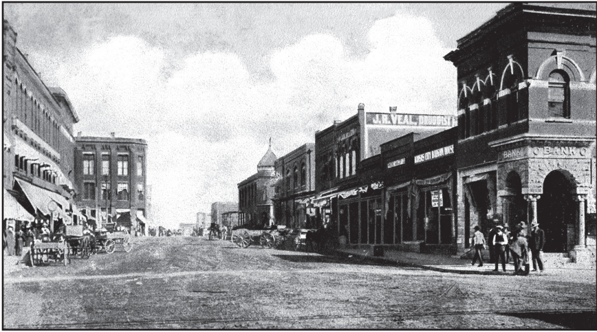
Second Street in Muskogee, looking north, 1908