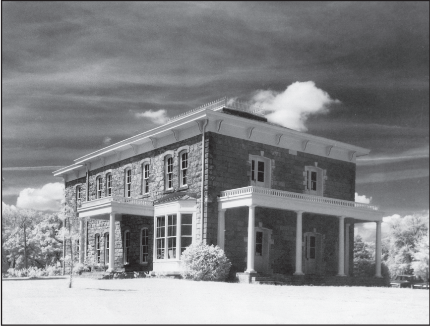
Union Agency in Muskogee

Tribes, was based in Muskogee beginning in 1894. Several years later, in 1898, Muskogee was officially incorporated as a town, and by 1900 the population was a little over four thousand. 5 Muskogee continued to grow rapidly, and by 1907, at the time of statehood, the population of Muskogee had grown to 14,418, making it the second largest city in Indian Territory. Its population was racially diverse, and a significant number of its residents—nearly one-third of the total population (4,298 people in the statehood census)—were African American. 6 As of the 1910 census, Muskogee County, of which Muskogee was the county seat, had a total population of 52,743, with 33,403 residents identified as “white,” 16,464 residents identified as “Negro,” and 2,886 identified as “Indian.” 7