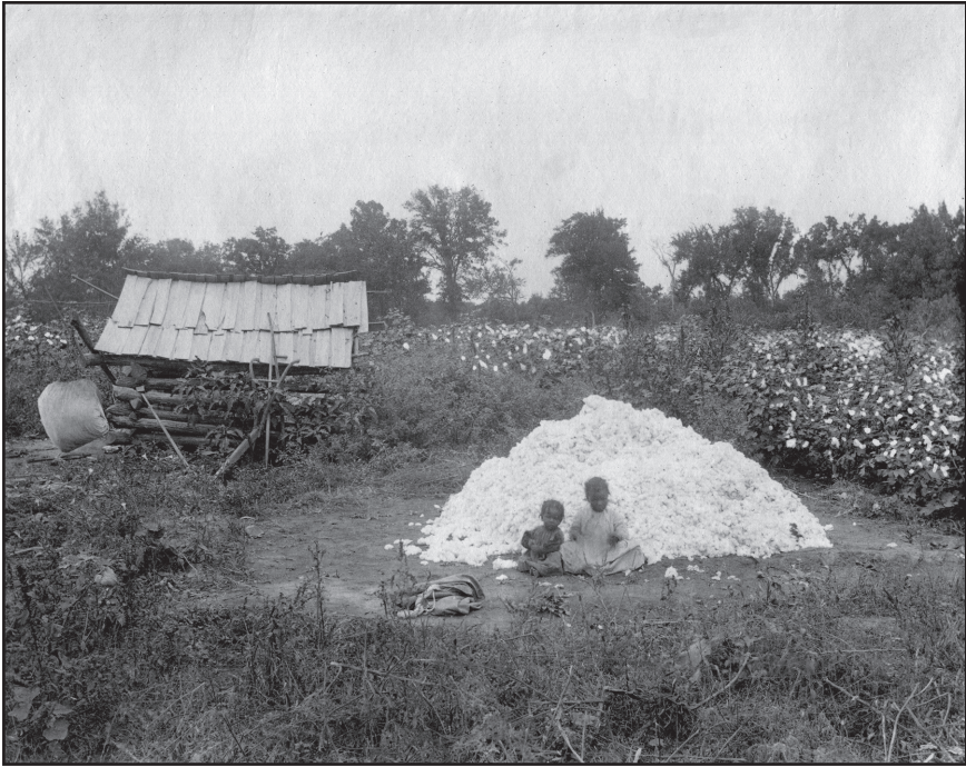
Two children in a cotton field near Muskogee, c. 1900

In response to the Democrats' constant criticism of Republican support of social equality as a way in which to gain support of citizens concerned about the "negro threat," a group of Republicans formed their own racist branch of the party—the lily-white Republicans. Lily-white Republicans, similar to the Democratic Party at the time, supported white supremacy and were opposed to black participation in Republican politics. To this end, they supported the separation of blacks and whites in schools, waiting rooms, and coaches. Perhaps the most surprising phenomenon that arose with the formation of the lily-white faction was the support it gained from some blacks as it became more powerful. Black support of lily-whites was, of course, reluctant, and occurred because blacks did not want the Republican Party as a whole, lily-whites notwithstanding, to lose ground to the Democrats. 15