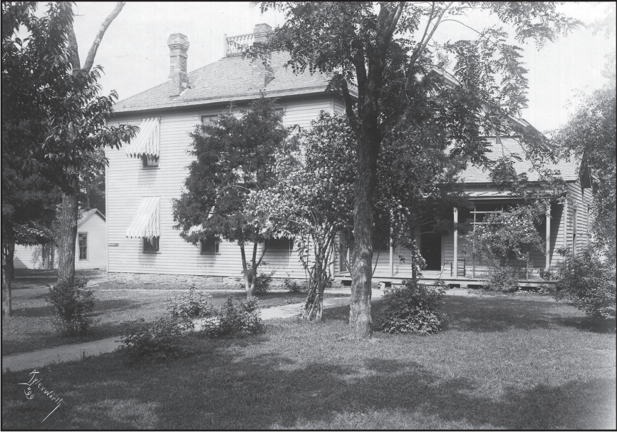
Dawes Commission headquarters in Muskogee, 1899

Republican, and Democratic Parties. Up until this point, the territorial election campaigns levied by each party lacked substance, and issues of political significance were not often debated. Instead of arguing over controversial issues, the issues on which each party focused during campaign seasons tended to be allegations that the opposing party's candidates had bad accounting practices or were "crooks." 9 Despite the fact that the parties did not often run campaigns on ideological premises, the question of how to settle the "race question" for the new state of Oklahoma became a significant platform issue that divided the three parties as preparations for statehood were made.