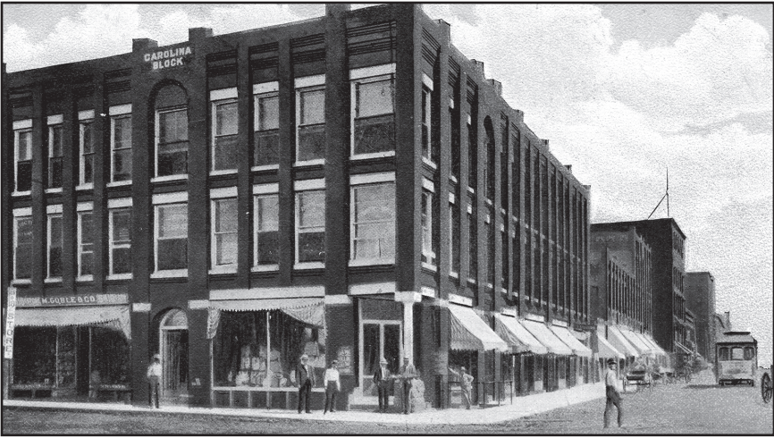
Carolina Building in Muskogee, 1907

one of the primary means through which political parties rallied support at the time, these four local newspapers provide significant insight into the ways this discourse was constructed and changed over time.