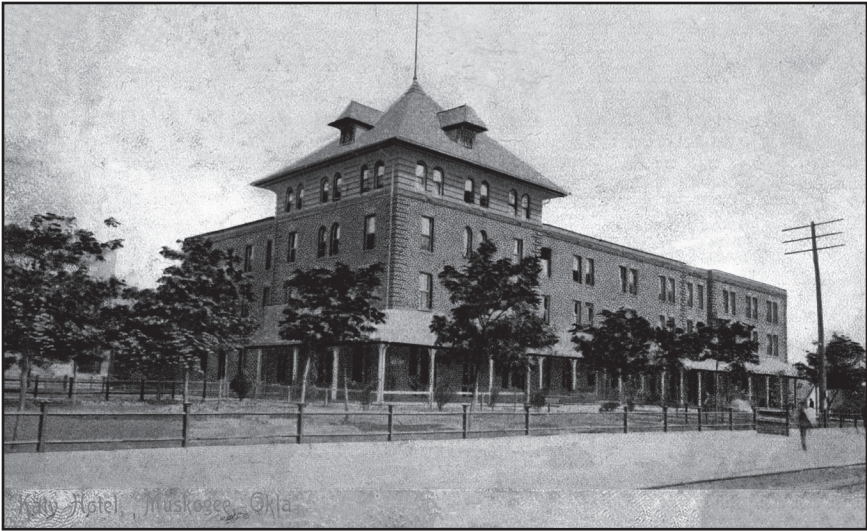
The Katy Hotel in Muskogee, 1907

place black politicians in minor political offices. Additionally, unlike the Democrats at the time, Republicans had a policy of “social equality” and did not seek implementation of Jim Crow laws limiting black rights in Indian Territory. 11