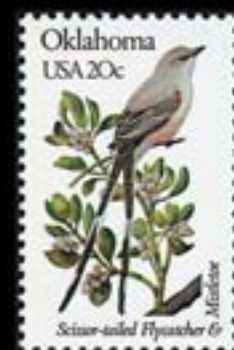
Mistletoe was used as a decoration for what somber occasion in winters past?