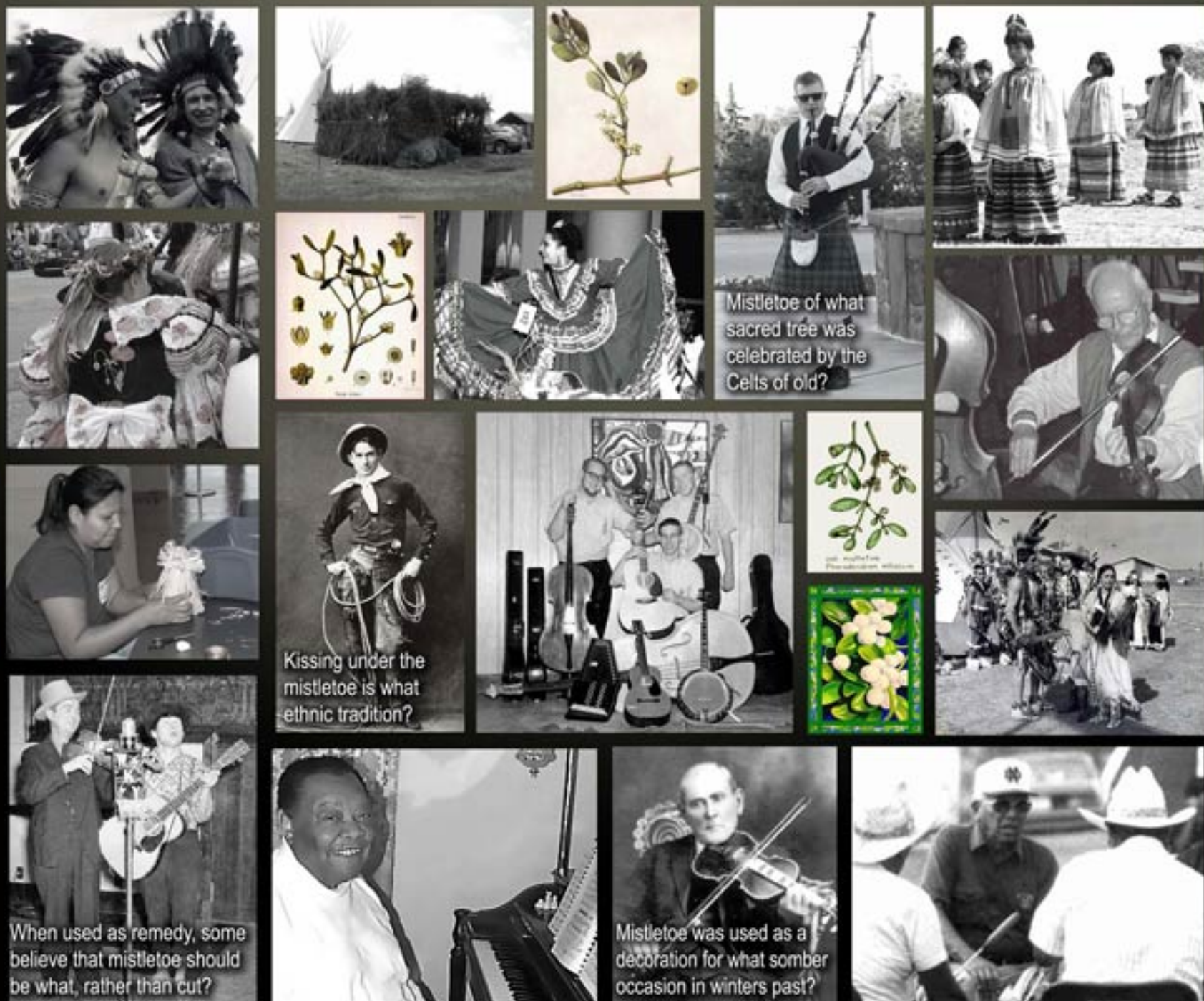
Mistletoe of what sacred tree was celebrated by the Celts of old?

For answers, search for "Oklahoma Folklife."