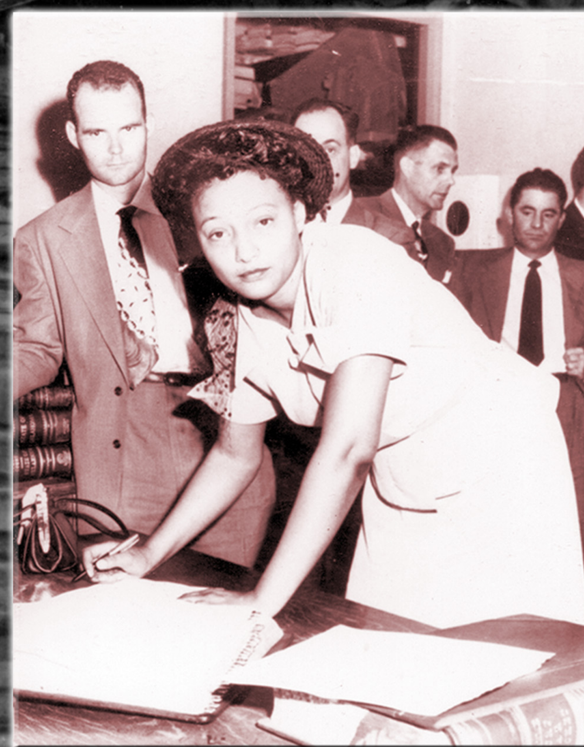
Ada Lois (Sipuel) Fisher 1924-1995