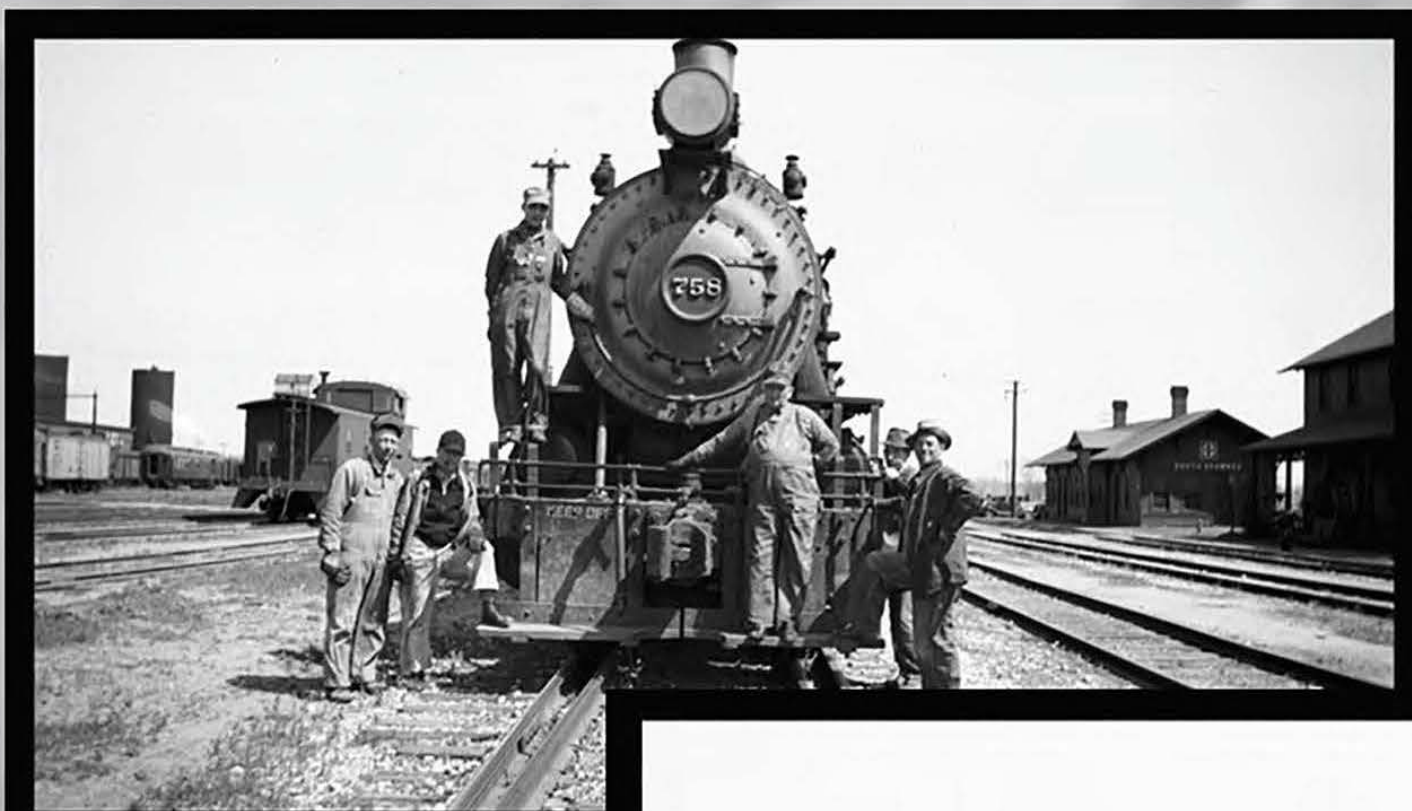
Switching crew for the Santa Fe Railroad in Shawnee, Oklahoma, 1937.