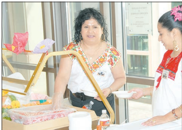
The Centennial Folklife Festival 2007.