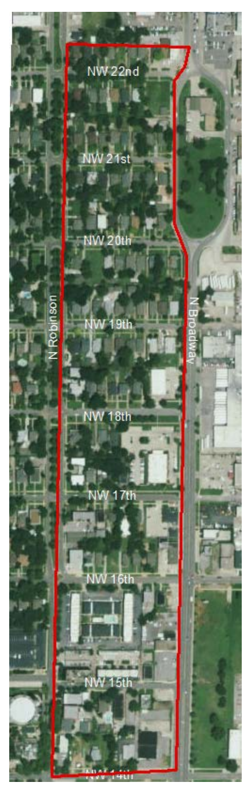
Map 1: Full Survey Area