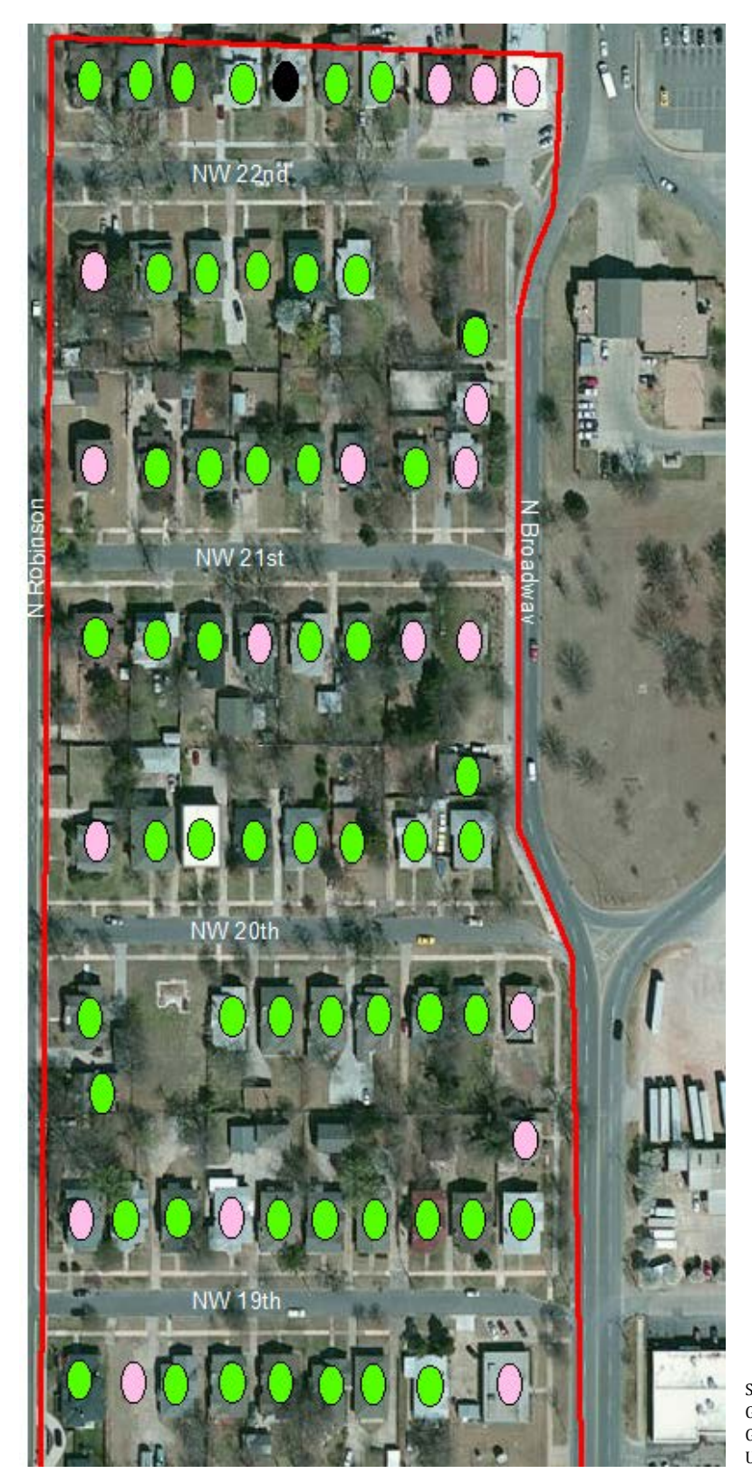
Map 2: North Survey Area, NW 22<sup>nd</sup> Street - NW 19<sup>th</sup> Street