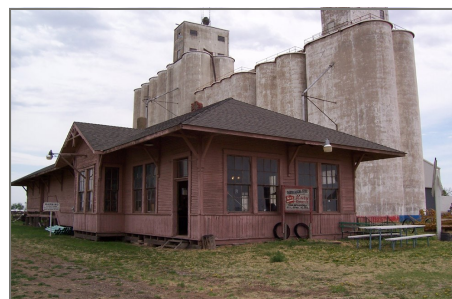
L to R: Keel Creek Bridge, Coal County; Rosamund, Tahlequah, Cherokee County; and Vici M-K-T Depot, Vici, Dewey County

You may reference the SHPO's Review and Compliance Manual which is available upon request from the SHPO or on the SHPO's web site at http://www.okhistory.org/shpo/shpom.htm (click on Programs and then on Section 106). Other sources of information include the Council at http://www.achp.gov and the OAS at http://www.ou.edu/archsurvey/ . The SHPO and OAS also present free workshops at least twice a year (May and December) and provide special presentations for agencies upon request.