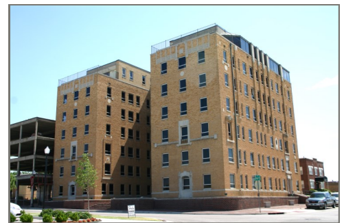
L to R: Oil Capital Historic District, Tulsa, Tulsa County; Depew Segment of Route 66, Creek County; and Osler Building, Oklahoma City, Oklahoma County

Yes. Section 106 requires federal agencies to consider the effects of their undertakings on properties listed in or eligible for the Register. It is the federal agency's responsibility to document and evaluate buildings, structures, sites, districts, and objects within the area of the potential effect of its undertaking and to request the SHPO's review of the documentation and the federal agency's opinion on Register eligibility. Once Register eligibility is established, the Section 106 process continues, and the eligible property is treated the same as a listed property.