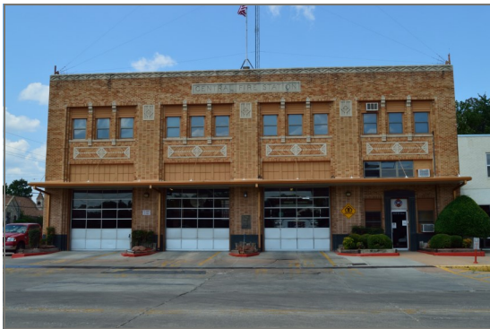
Central Fire Station, Lawton, Comanche County

Section 106 of the National Historic Preservation Act requires federal agencies and their authorized designees to consider the effects of their undertakings on archeological and historic properties listed in or eligible for the National Register of Historic Places. The State Historic Preservation Office assists these agencies to meet their responsibilities under the Act. Following are several frequently asked questions about the Section 106 process. For simplicity, several acronyms/short forms are used including: Act=National Historic Preservation Act, Council=Advisory Council on Historic Preservation, Register=National Register of Historic Places, OAS=Oklahoma Archeological Survey, and applicant=any nonfederal entity dealing with Section 106.