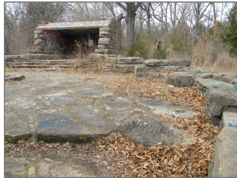
Lake Ponca Duck Pond Park, Ponca City, Kay County