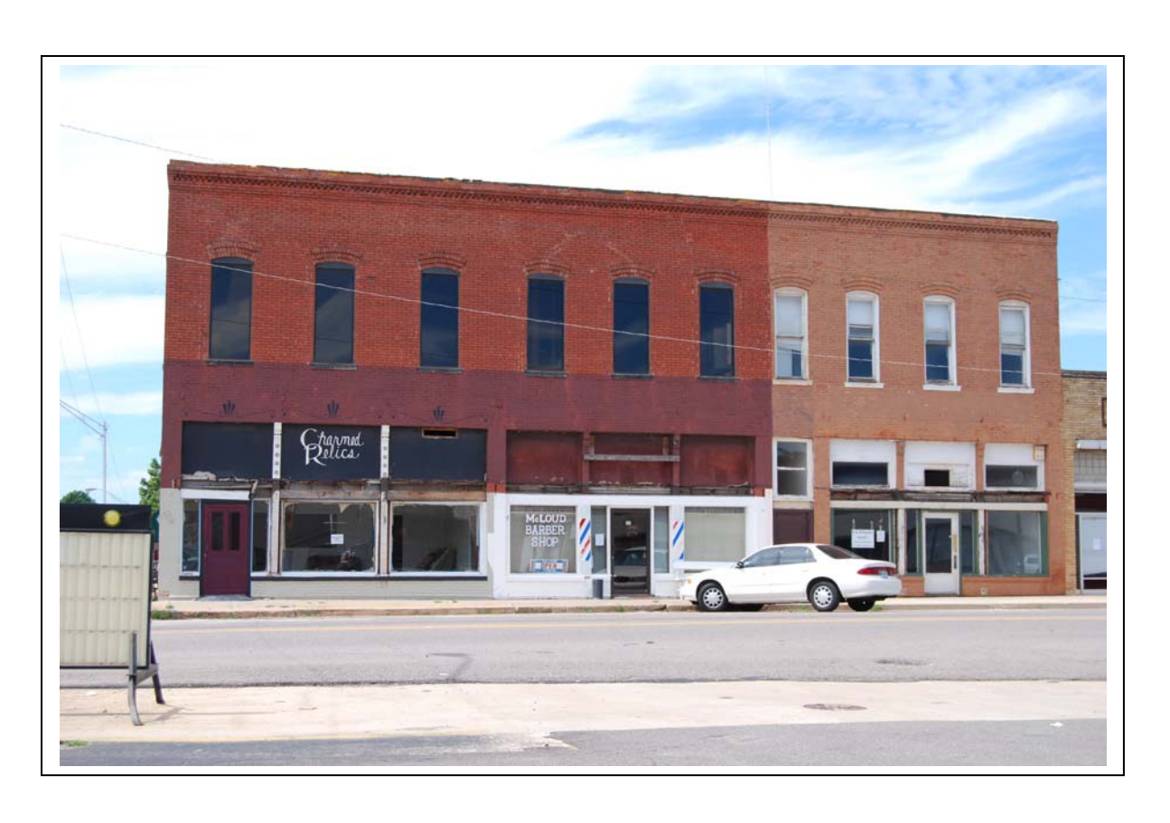
Commercial Building, Broadway & Main, NW corner