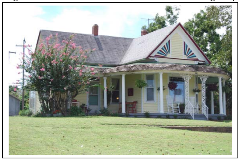
Gabled-Ell cottage 3<sup>rd</sup> & Broadway

There are two outstanding picturesque cottages that meet the National Register standards under Criterion C, for their architectural significance. One is located near the southwest corner of Broadway and 3<sup>rd</sup> Street (Highway 102). A Gabled-Ell cottage of one story, its decorative siding, wrap around porch, and Queen Anne windows appear to be intact and original. It is located on lots 5-7, Block 20 of the original plat.