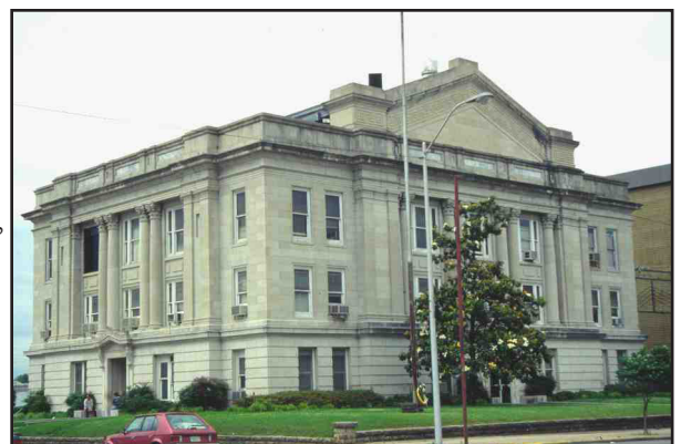
Creek County Courthouse, Creek County

Historic Preservation Resource Identification data is an important information source used to evaluate historic properties that may be affected by federal undertakings as well as to plan future preservation efforts. The collection of this information provides an overview of similar resources that, taken together, form a property type. This property type, placed in a context with specific time and geographical limits in turn provides the basis for generalizations about other historic resources that may occur within similar contexts. Historic Preservation Resource Identification is thus an ongoing process of gathering and evaluating information related to the historic resources of our state.