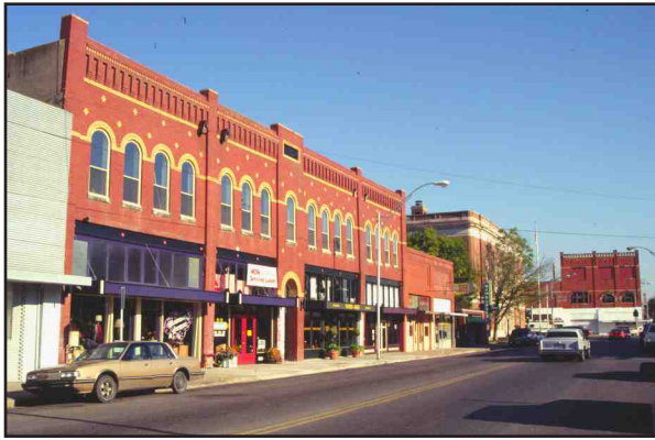
Ardmore Historic Commercial District, Carter County