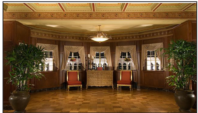
Skirvin Hilton Hotel, Oklahoma County (exterior & interior)