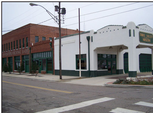
Durant Downtown Historic District, Bryan County