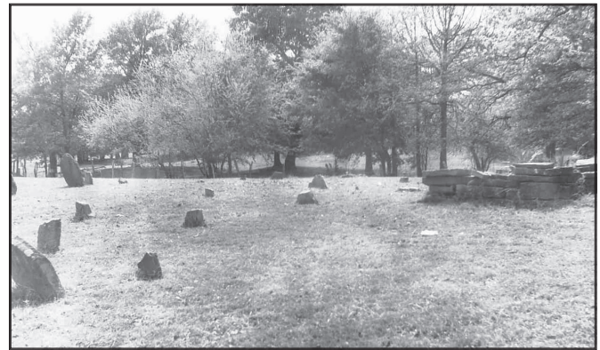
Middle Boggy Battlefield, Atoka County

A cemetery is eligible for the National Register of Historic Places if it derives its primary significance from graves of persons of transcendent importance, from age, from distinctive design features, from association with historic events or if it has the potential to yield important information if that information is not available in extant documentary evidence.