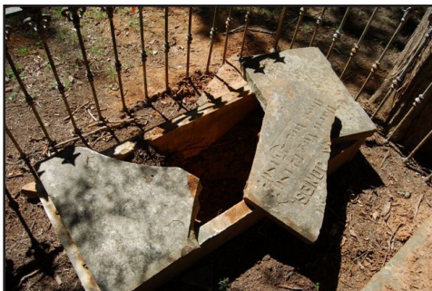
Rose Hill Plantation Cemetery, Choctaw County

Although a cemetery can be listed on the National Register of Historic Places, as with all properties, this does not guarantee perpetual maintenance of the resource. The Oklahoma SHPO does not have any legal authority concerning the preservation of cemeteries. There are no grants available for cemetery restoration or maintenance.