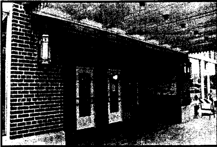
Restored Front Entrance - The "Aldridge Apartments"