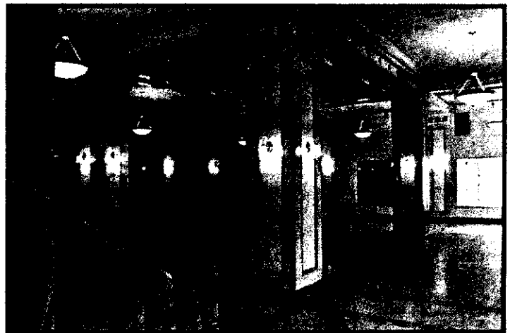
Restored Hotel Lobby