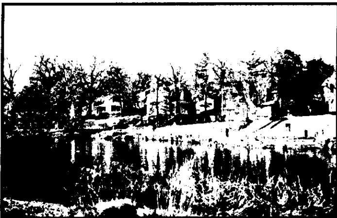
Swan Lake Historic District

Tulsa's Swan Lake Historic District contains over five hundred resources, including two parks and the historic Swan Lake, which has a Works Progress Administration-built fountain. The primarily residential district is bounded by East 15th Street, South Utica Avenue, East 21st Street, and South Peoria Avenue. The district is significant as an example of Tulsa's middle class neighborhoods which developed during the first half of the twentieth century. Developed during the period when Tulsa was transforming from an agricultural market town to the "Oil Capitol of the World," Swan Lake illustrates the variety of architectural styles popular at the time. Reflecting the impact of the oil industry on residential development in Tulsa, the district contains many elaborate, architect-designed residences, such as the Spillars House at 1505 East 19th Street. The neighborhood also boasts the most 1920's and 1930's two- and three-story apartments and duplexes of comparable neighborhoods. Also noteworthy in the district is the Christ the King Church. Designed by Barry Byrne, the church combines the Byzantine, Gothic, and Art Deco styles.