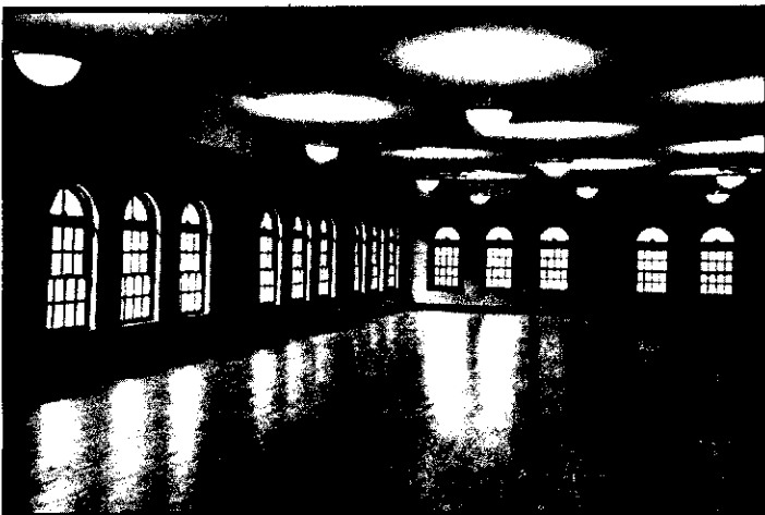
The Aldridge Ballroom where the Dedication Ceremony was Held