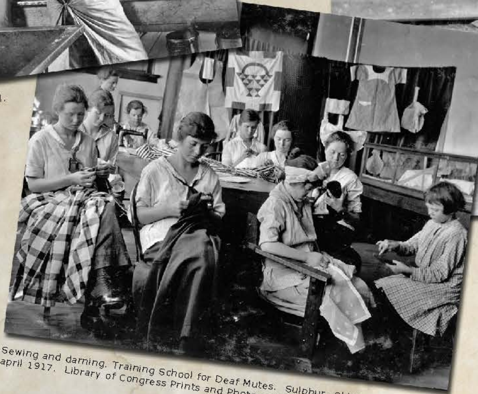
Sewing and darning. Training School for Deaf Mutes. Sulphur, Oklahoma, April 1917.