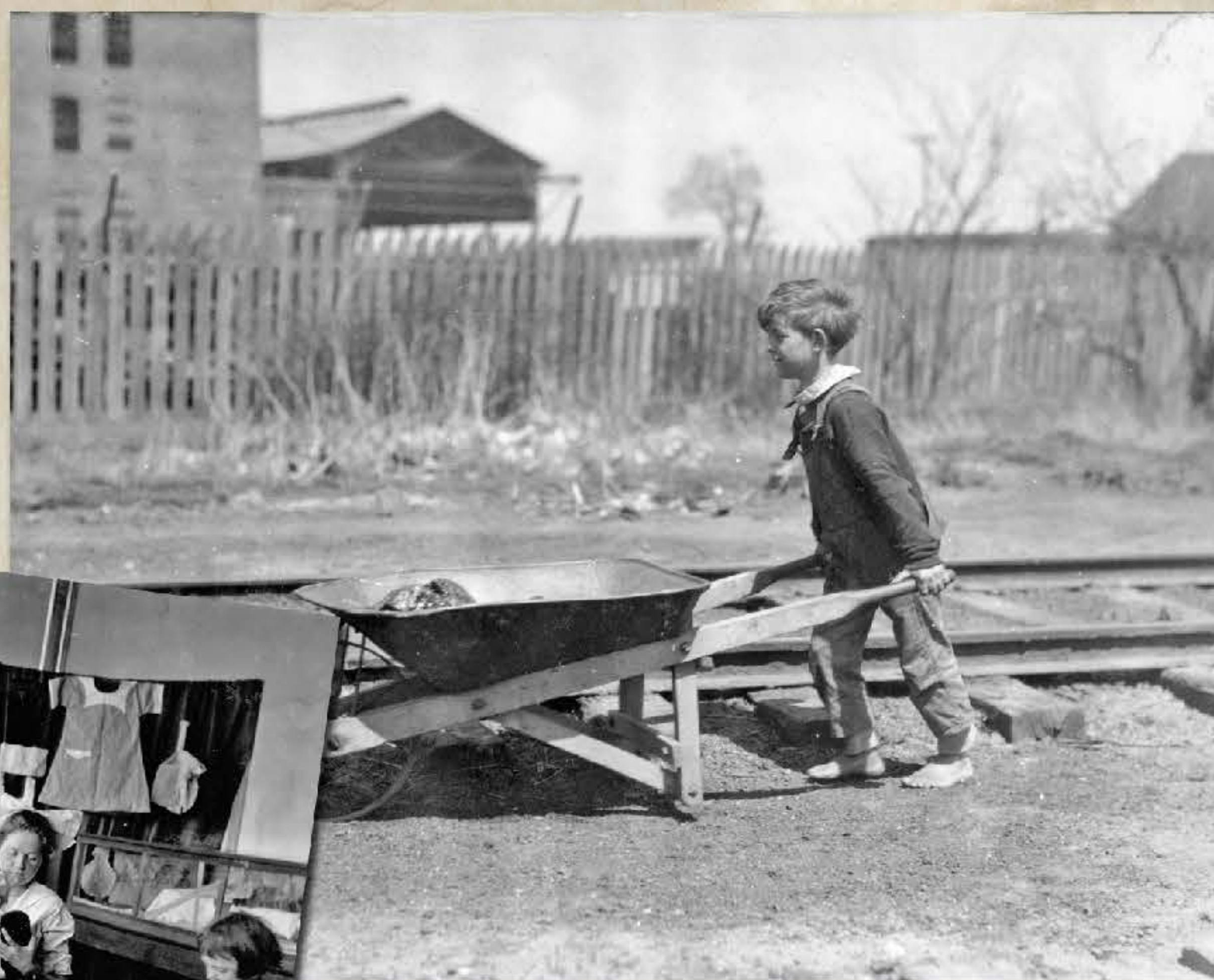
Swipin' coal from the freight yards. Oklahoma City, Oklahoma, April 1917.