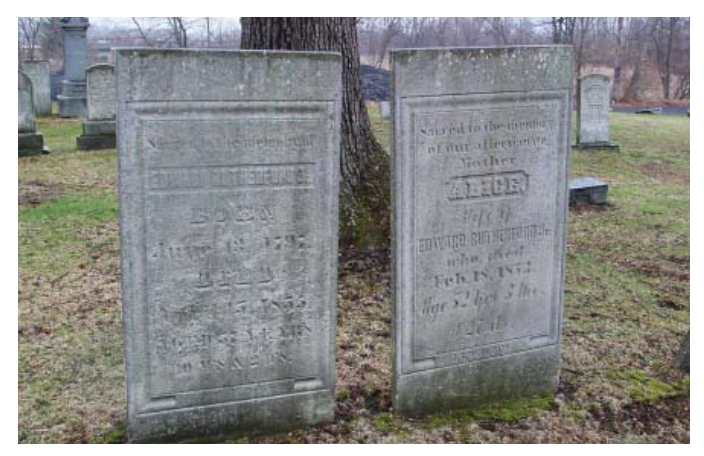
Figure 2. These mid-19th century, single-element stone grave markers in the Grove Cemetery in Bath, NY, are set in a vertical position.

slot" grave marker, the tabbed upper stone was set in a slotted base. More common today, the upper headstone is secured with a technique that uses small spacers set on the base and a setting compound. This technique or one that uses an epoxy adhesive may be found on older markers where the stones have been reset.