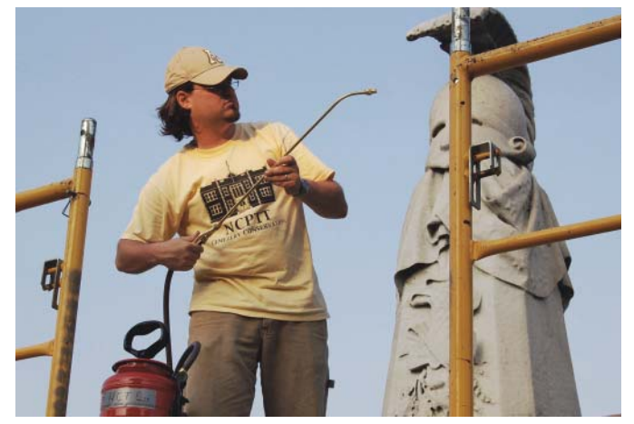
Figure 24. A severely deteriorating monument or grave marker can be treated with a stone consolidant. The treatment is usually applied using a spray system. The consolidant soaks into the stone and replaces mineral binders that hold the stone together. On-site and laboratory testing and evaluation are performed prior to using this non-reversible type of treatment.

When erosion is severe, consolidation treatments (e.g., ethyl silicate) have been used to replace mineral binders lost to weathering (Fig. 24). Because these treatments are not reversible, laboratory and on-site testing are essential. Application by a conservator or other experienced preservation professional is advised.