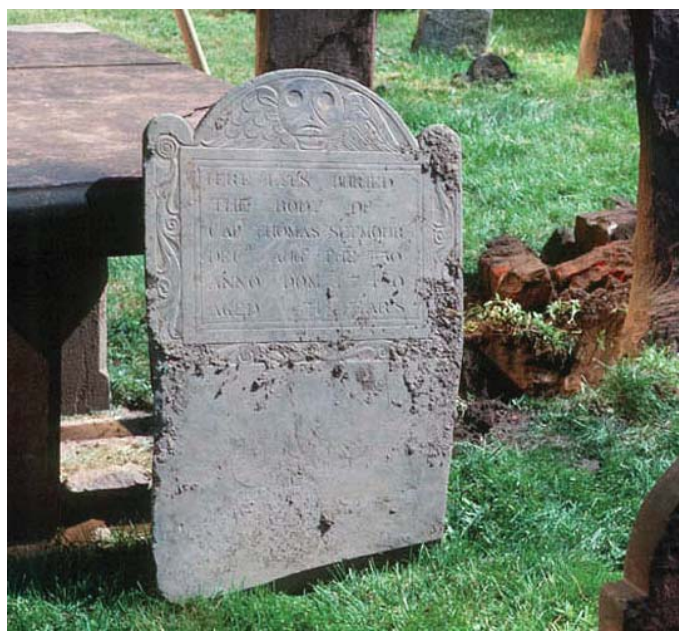
Figure 20a. This slate grave marker in the Ancient Burying Ground in Hartford, CT, is a ground-support stone. Resetting requires digging a hole that will hold the base of the stone and then compacting the soil at the bottom of the hole by hand.

Inexperienced staff or volunteers should not attempt resetting without training from a conservator, engineer, or other preservation professional. When dealing with fragile or significant grave markers, or those with large