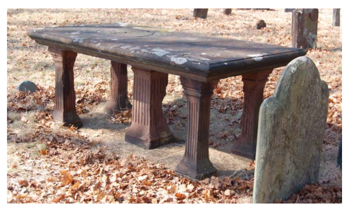
Figure 4. This sandstone table tomb, located in Cedar Grove Cemetery, New London, CT, is an engineered grave marker structure consisting of a horizontal stone tablet supported by four vertical table "legs" with and a central column,.

Grave markers can also be engineered structures. Examples of grave marker structures include masonry arches, box tombs, table tombs, grave shelters, and mausoleums (Fig. 4). The box tomb is a rectangular structure built over the gravesite. The human remains are not located in the box itself as some believe, but rather in the ground beneath the box structure. The table tomb is constructed of a horizontal stone tablet