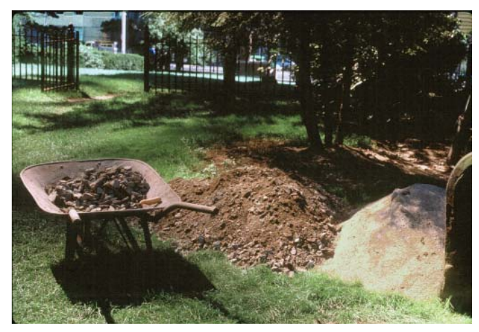
Figure 20b. To facilitate drainage, crushed stone, gravel, and sharp sand line the hole and are hand-tamped around the stone after placement.