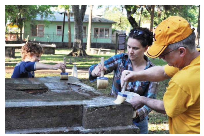
Figure 23. Limewash is a breathable coating sometimes used to protect the surface of the grave marker and provide a decorative finish. Limewash is applied by brush in five to eight thin coats (with each coat about the consistency of skim milk). The surface is allowed to slowly dry between coats. Sometimes the surface is covered by damp burlap to slow the drying process.

Limewash is a traditional coating that brightens stuccocovered grave markers (Fig. 23). Like paint coatings, it needs to be periodically applied. Limewash is prepared with lime putty or hydrated lime and water. Curing begins following application. The lime putty or hydrated lime reacts with carbon dioxide in the air in a process called carbonation. This reaction eventually forms calcium carbonate, a stable hard coating. Limewash is a "green" coating with no volatile organic compound content and is "breathable," i.e., it allows for water vapor transmission. Although commonly white, limewash can be colored or tinted with alkali-stable pigments such as iron oxide.