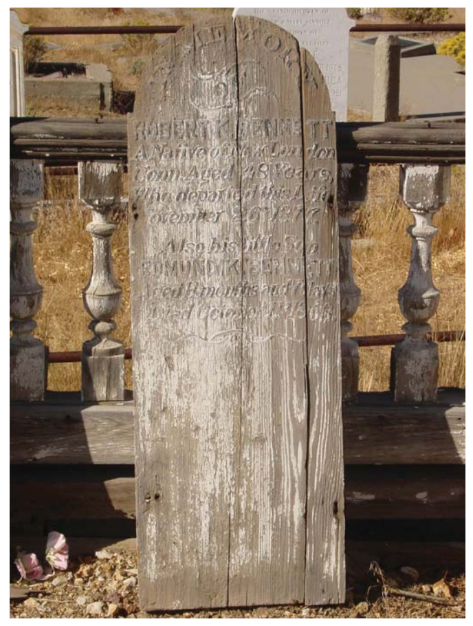
Figure 7. As shown by this 1877 marker in Silver Terrace Cemetery, Virginia City, NV, exposure to sunlight can damage wood grave markers, making the wood more susceptible to water damage and cracking.

appearance and influence wood properties. Woodcell walls and cavities contain moisture. Oven drying reduces the moisture content of wood. After the drying process, the wood continues to expand and contract with changes in moisture content. The loss of water from cell walls causes wood to shrink, sometimes distorting its original shape (Fig. 7).