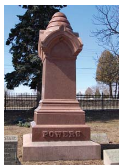
Figure 5. A variety of colors of natural stone are found in historic cemeteries, such as this pink granite marker in the Cedar Grove Cemetery, New London, CT.

the selection of materials and procedures for its cleaning and protection.