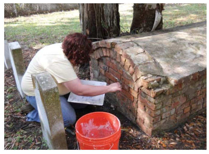
Figure 19. Masonry markers like this box tomb may require the repointing of mortar joints. It is important to use a mortar that is softer than the historic brick. In this case a conservator uses a lime putty-based mortar to repoint.

Most importantly, what is the masonry substrate that requires repointing? What mortar mix is suitable for the historic masonry? How quickly will mortar need to cure? Soft mortars contain traditional lime putty or modern hydrated lime. Harder mortars contain natural or Portland cement. If necessary, mortars can be tinted with alkali-stable pigments to match historic mortar colors. The selection of the mortar to be used is critically important to the success of the project. An inappropriate mortar can result in unattractive work and accelerate the deterioration of the historic grave marker. Always avoid the use of bathtub caulk and silicone sealants for repointing mortar joints.