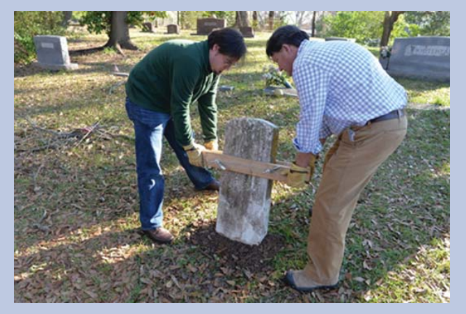
Figure E1. The simple wooden clamp system allows two people to safety lift a marble grave marker.

Proper work practices and lifting techniques need to be used whenever lifting or resetting grave markers. Many markers are surprisingly heavy. For example, a common upright marble headstone measuring 42" long, 13" wide, and 4" deep weighs over 200 pounds. Volunteers and workers should work in pairs, be able bodied, and have training in safe