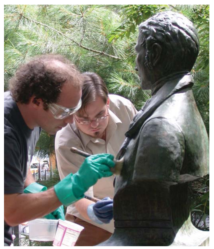
Figure 22. A protective coating must be maintained on metal elements. Wax or lacquer coatings help preserve the bronze patina and slow corrosion. Conservators apply a microcrystalline wax to this bust at St. Mark's Church in-the-Bowery, New York, NY.

Wax coatings are often used for bronze markers (Fig. 22). Wax provides a protective barrier against moisture, soiling, and graffiti. There are several steps in the wax application process. Where there is little corrosion, gentle cleaning of the marker is undertaken prior to applying the wax coating. Apply a thin layer of wax to the marker using a stencil brush or chip brush. Mineral spirits can be added to the wax to facilitate