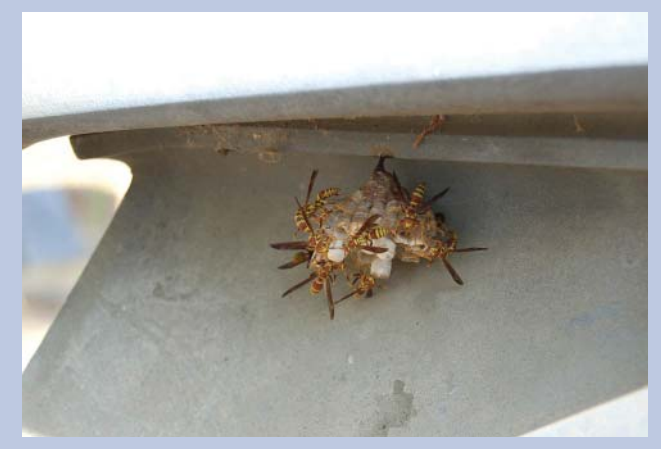
Figure D. Yellow jackets that are nesting below the projecting molding of this grave marker pose a hazard to visitors and staff because, if disturbed, they will vigorously defend their nest. Yellow jacket, paper wasp and hornet nests should be removed from grave markers by trained staff or specialists.

Snakes, wasps, and burrowing animals inhabit historic cemeteries (Fig. D). Snakes sun on warm stones and hide in holes and ledges, so it is important to be able to identify local venomous snakes. An appropriate venomous snake management plan should be in place, and