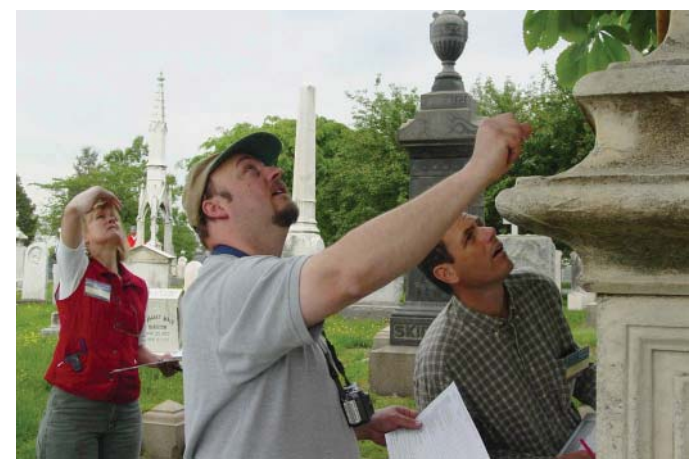
Figure 15a. Condition surveys are undertaken to document current conditions, determine safety issues, and plan both emergency stabilization and future treatment plans. There are a variety of survey forms available that can be tailored to the specific cemetery.

A tool kit for the condition assessment may include binoculars, digital camera, magnifying glass, measuring tape, clipboard, carpenter's rule, level, magnet, and flashlight. For large monuments, a ladder or aerial lift may be required. Photographs of each marker, including overall shots and close-up details, are an essential part of the documentation process. Photo logs are helpful for