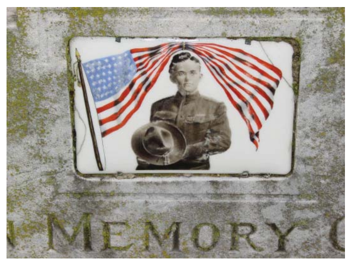
Figure 8. A fired ceramic, this cameo is set in a marble grave marker, located in Elmwood Cemetery, Memphis, TN. Different materials may require different conservation approaches.

Old cemeteries often include a wide variety of other materials not normally associated with contemporary grave markers, such as ceramics, stained glass, shells, and plastics (Fig. 8). As with masonry, metals, and wood, each has its own chemical and physical properties which affect durability and weathering. These materials