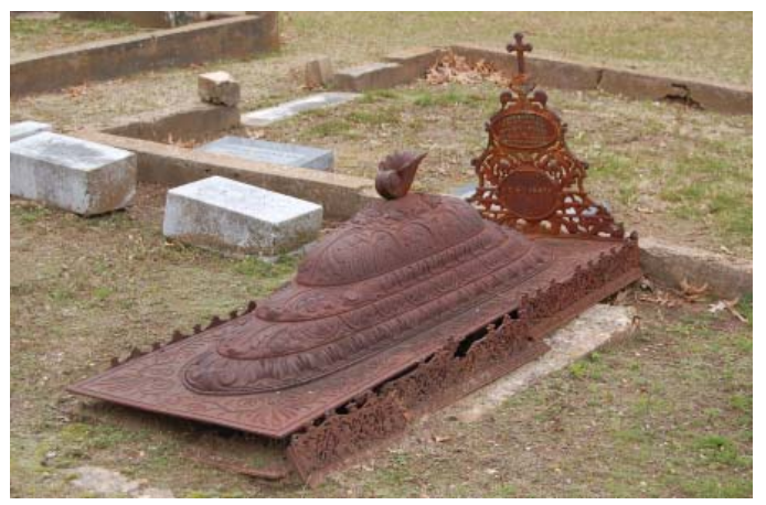
Figure 6. Decorative cast-iron grave markers like this late-19th century one in Oakland Cemetery in Shreveport, LA, are produced by heating the iron alloy and casting the liquid metal into a mold.

Metals are solid materials that are typically hard, malleable, fusible, ductile, and often shiny when new (Fig. 6). A metal alloy is a mixture or solid solution of two or more metals. Metals are easily worked and can be melted or fused, hammered into thin sheets, or drawn into wires. Different metals have varying physical