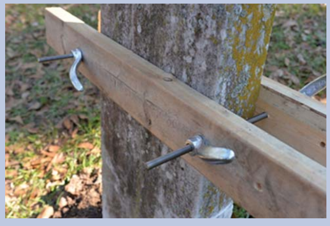
Figure E2. The clamp system is constructed from off-the-shelf wooden boards.

lifting techniques. Lift equipment and ergonomically correct tools should be routinely used to lift heavy markers (for most people this includes markers that weight more than 50 pounds). For smaller grave markers, a simple wooden clamp system can be constructed for a two-person lift (Figs. E1 and E2).