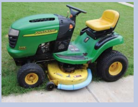
Figure B. A pool 'noodle' can be fitted to the deck of a lawnmower to prevent damage to grave markers.

Ongoing maintenance of cemetery vegetation is essential to conserve grave markers and fencing. Periodic inspections may warrant removing trees; trimming tree limbs, shrubs, and vines; and removing volunteer vegetation. All trees should be inspected at least every five years. Annual inspections are necessary to assess the condition of shrubs and vines, and to identify volunteer growth for removal. Mowing and trimming around the hundreds of stone, brick, iron, and wood features found in many cemeteries is a weekly or bi-weekly chore. Lawn care is the most time-consuming, and, if not done carefully, potentially destructive maintenance activity in historic cemeteries.