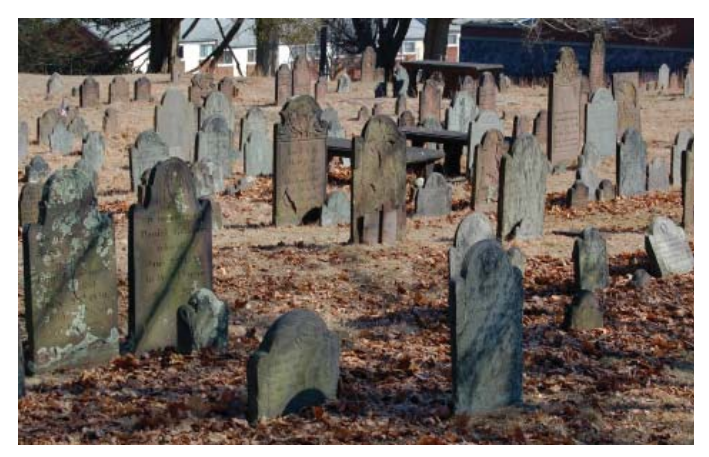
Figure 1. Sandstone and slate grave markers in the Ancient Burying Ground in New London, CT, display a variety of weathering conditions. Markers in the cemetery date from the mid-17th to the early 19th centuries.

This Preservation Brief focuses on a single aspect of historic cemetery preservation—providing guidance for owners, property managers, administrators, inhouse maintenance staff, volunteers, and others who