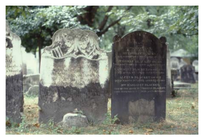
Figure 9. The limestone and sandstone grave markers in this historic cemetery have different weathering processes. On the left, the limestone shows surface loss in areas exposed to rainwater and gypsum crust formation below. The sandstone marker on the right displays uniform soiling, but surface hardening may be occurring.

All grave marker materials deteriorate when they are exposed to weathering such as sunlight, wind, rain, high and low temperatures, and atmospheric pollutants (Fig. 9). If a marker is composed of several materials, each may have a different weathering rate. Some weathering processes occur very quickly, and others gradually affect the condition of materials. Weathering results in deterioration in a variety of ways. For example, when exposed to rainwater some stones lose surface material while others form harder outer crusts that may detach from the surface.