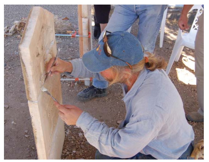
Figure 21. Cracks in a stone marker should be filled to keep water and debris out and prevent the crack from becoming larger. A patching mortar is designed to be used, in this case, with historic marble.

Hairline masonry cracks may be the result of natural weathering and require no immediate treatment except to be photographed and recorded. However, larger cracks often merit further attention. Repairing masonry cracks involves several steps and typically a skilled hand (Fig. 21). The repair begins with the removal of loose material and cleaning. Materials that are used for crack repair include grouts for small cracks and epoxy for large cracks affecting the structural integrity of the monument. Gravity or pressure injection is used to apply grout or epoxy. Crack repair can be messy, so careful planning and experience are helpful. If the crack is active, a change in size of the crack will be noted over time. Active cracks require further investigation to ascertain the cause of the changes, such as differential settlement, and to correct, if possible, the cause prior to repairing the crack.