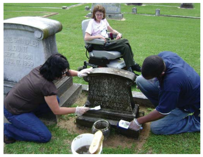
Figure 17. Volunteers can undertake cleaning of grave markers once they have received initial training. Cleaning methods may include wetting the stone, using a mild chemical cleaner, gently agitating the surface with a soft bristle brush, and thoroughly rinsing the marker with clean water.

General maintenance may involve low-pressure water washing. In most cases, surface soiling can be removed with a garden hose using municipal water or domestic