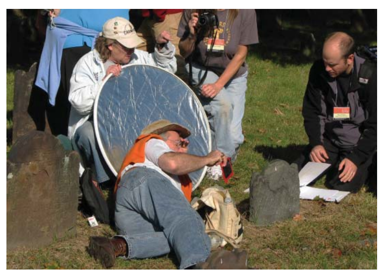
Figure 15b. Photographs are used to document the condition of the grave marker as part of a condition assessment.