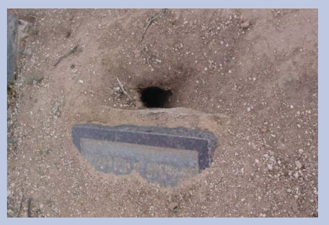
Figure C. Gophers and other burrowing animals produce uneven ground and holes that are trip and falling hazards to visitors and staff of historic cemeteries.

Trip and falling hazards include uneven ground, holes, open graves, toppled grave markers, fallen tree limbs, and other debris (Fig. C). Sitting, climbing, or standing on a grave marker should be avoided since the additional weight may cause