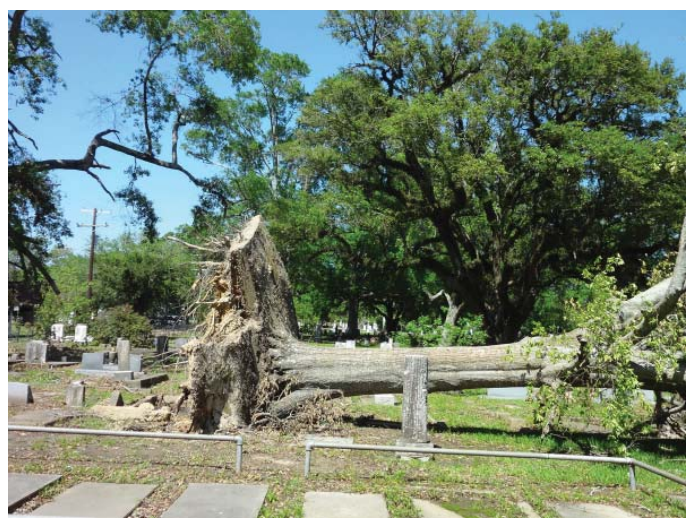
Figure 11. Woody vegetation can damage grave markers and pose a risk to visitors unless well managed and maintained.

Aside from vandalism and purposeful neglect, most risk factors attributable to human activity are unintentional. Sometimes damage to grave markers is the result of cleaning or repair done with the best of intentions. These unfortunate mistakes can be the result of insufficient training and funding, misuse of tools and equipment, and poor planning. With proper training and supervision, human risk factors can be lessened.