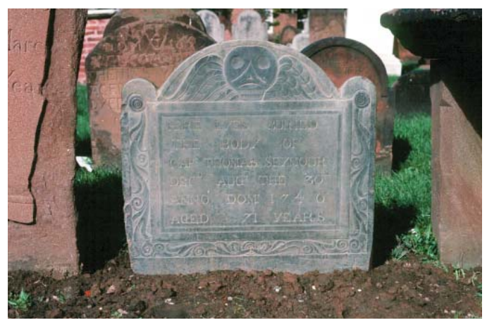
Figure 20c. The reset ground-supported grave marker should be level and plumb.