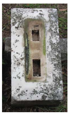
Figure 3. A multi-element grave marker from the early 19th century in the St. Michael's Cemetery, Pensacola, FL, consists of a vertical element with tabs (left image) into a slotted base (right image).

Stacked-base grave markers use multiple bases to increase the height of the monument and provide a stable foundation for upper elements. Tall, four-sided tapered monuments, known as obelisks, are typically placed on stacked bases. Columns or upright pillars have three main parts – a base, shaft, and capital. Multiple-element grave markers may also include figurative or sculptural components. Traditionally, stacked base grave markers were set on lead shims with mortar joints or with lead ribbon along the outer edges.