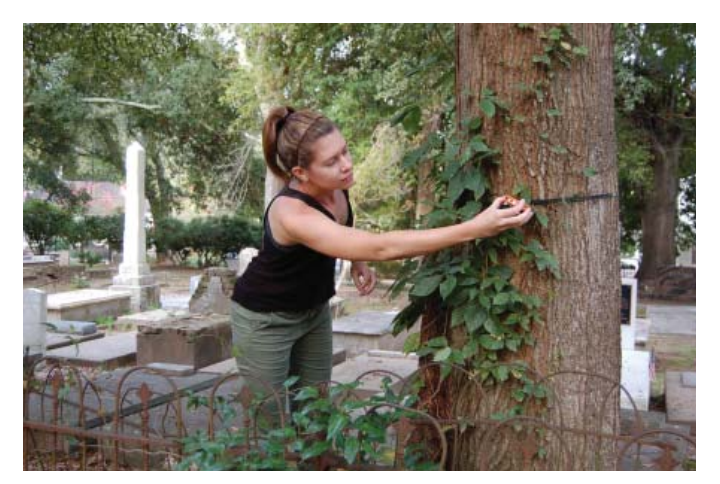
Figure 12. A cemetery professional undertakes a tree inventory in American Cemetery, Natchitoches, LA, to determine the health of trees in the cemetery. Management decisions for trimming or removal are based on the inventory.

Inappropriate maintenance activities can be devastating. One of the most common threats stems from improper lawn care, particularly the misuse of mowing equipment and string trimmers (weed whackers). The use of large mowers or mishandling them can lead to displacement of markers. Scrapes, gouges and even breakage also can occur. Improper use of string trimmers in areas immediately adjacent to grave markers can result in