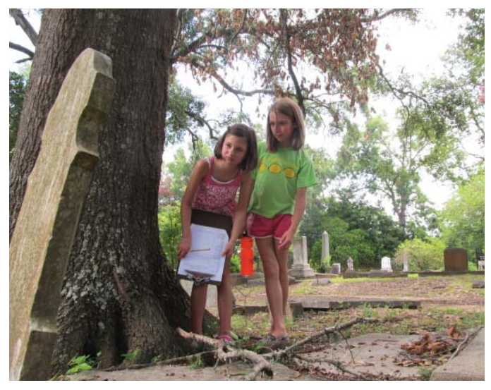
Figure 25. Involving the community in activities helps to develop an appreciation for the cemetery and serves to deter vandalism. Events may include children through school or scouting organizations and can help teach across the curriculum.

Maintenance is the key to extending the life of historic cemetery grave markers. From ensuring that markers are not damaged by mowing equipment and excessive lawn watering, to proper cleaning and resetting, good cemetery maintenance is the key to extending the life of grave markers. Whether rescuing a long-neglected small cemetery using volunteers or operating a large active cemetery with paid staff, the cemetery's documentation, maintenance and treatment plans should include periodic inspections. Only appropriate repair materials and techniques that do not damage historic markers should be used and records should be kept on specific repair materials used on individual grave markers. A well-maintained cemetery provides an attractive setting that can be appreciated by visitors, serves as a deterrent to vandalism, and provides a respectful place for the dead. A community history recorded in stone, wood and metal markers, cemeteries are an important part of our heritage, and are deserving of preservation efforts (Fig. 25).