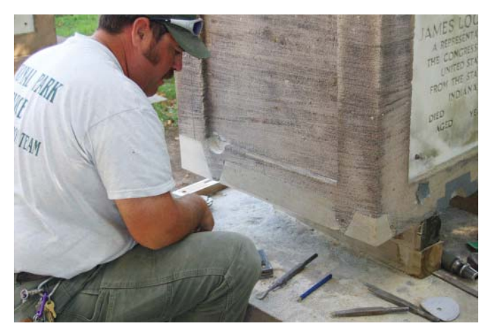
Figure 16. A professional mason works to insert a new piece of stone. Often referred to as a "dutchman", this repair technique requires replacing the deteriorated stone section with a new finished piece of the same size and material.

The cemetery manager can use the information from the condition assessment report to develop a maintenance plan with a list of cyclical maintenance work. Many tasks can be carried out by in-house staff. For example, maintenance cleaning of metal and stonework can often be accomplished by rinsing with a garden hose. Applications of wax coatings can be used to protect bronze elements. Trained staff can undertake these tasks. Teaching graffiti removal techniques to cemetery staff may also be necessary if vandalism is an on-going problem. Staff should have access to written procedures