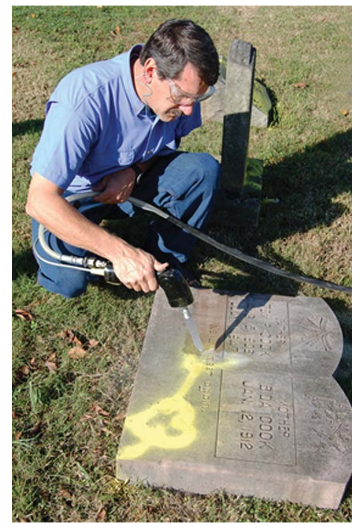
Figure 18. Graffiti is carefully removed using a low-pressure dry-ice misting instrument.

If the graffiti is water soluble, it can be removed using water and a soft cloth or towel. Rinsing the cloth frequently helps to avoid smearing graffiti on unaffected areas. If the graffiti is not water soluble, organic solvents or commercial graffiti removal products suitable for the grave marker material are recommended. Products should be tested prior to use. General cleaning of the entire marker is a good follow-up for a more even appearance. For deep-seated graffiti, poultice cleaning (previously described) may be required to extract staining materials.