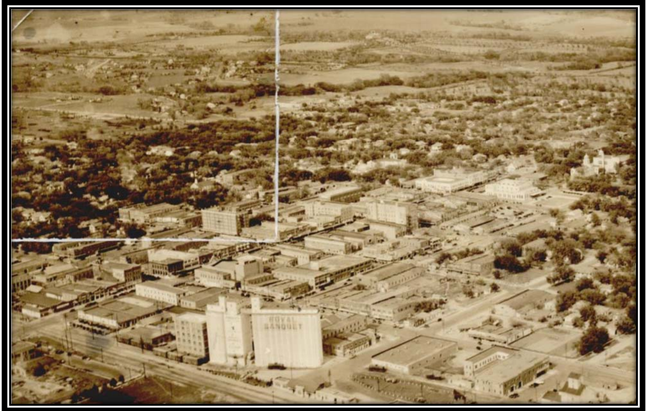
Historic Aerial Photo of Downtown Ponca City (Undated).