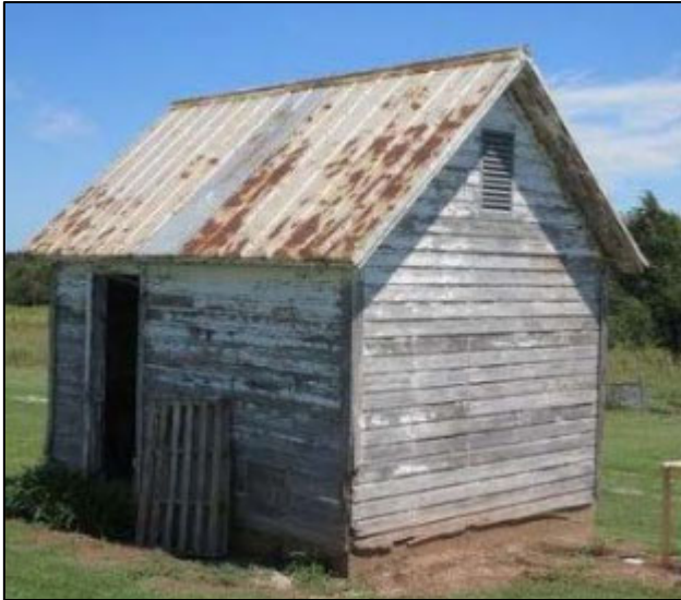
USDA Asset #621800BA10