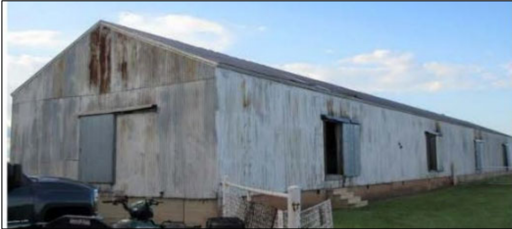
Footprint: 6,480 gross square feet