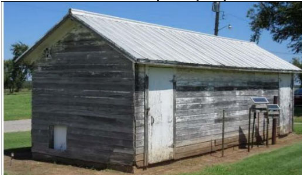
Footprint: 280 gross square feet