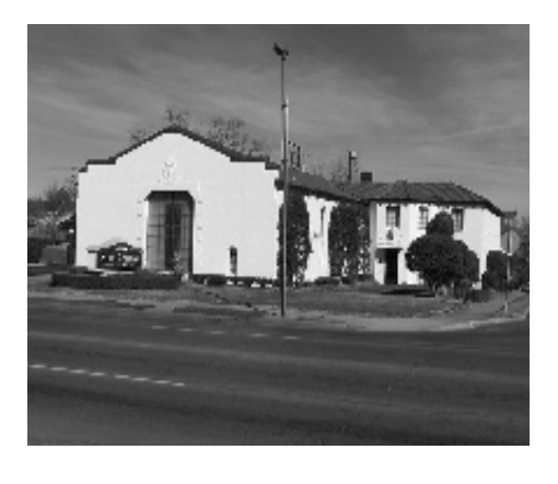
Smith & Kernke Funeral Home Oklahoma City