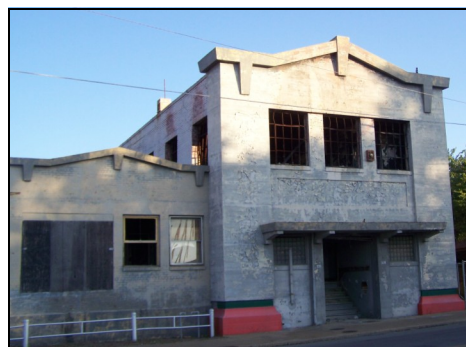
Midland Valley Office Building.

The Midland Valley Railroad was a significant contributor to the early development of Oklahoma's oil industry and Muskogee represented the first Midland Valley station in the