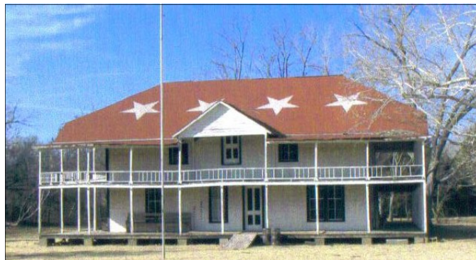
Star House, Cache.

Built around 1890, the Star House was the home of Quanah Parker, celebrated Comanche warrior and statesman. Nearly destroyed by Ft. Sill in the 1950s, the house was rescued and later moved to Eagle Park as part of a historical theme park. The Star House remains at Eagle Park - utilized by descendants of Quanah and the Comanche Nation for ceremonies and reunions - but is in serious need of stabilization.