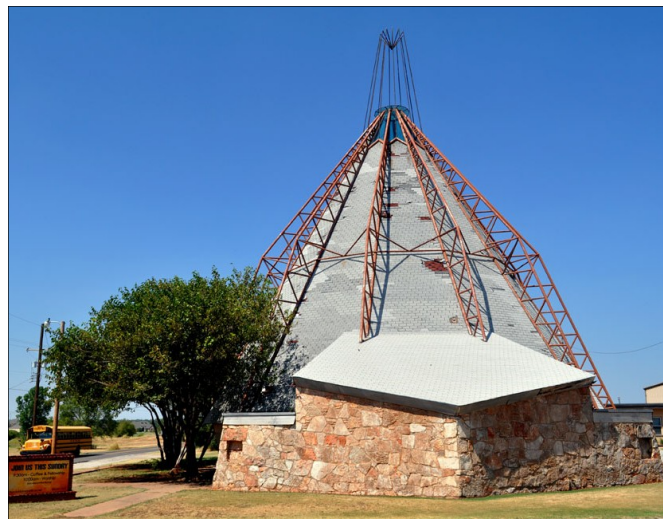
Hopewell Baptist Church.

Designed by Bruce Goff and constructed through the volunteer efforts of the congregation, the iconic Hopewell Baptist Church was once featured by TIME magazine. Vacated since the late 1980s, the church faces an estimated $2 million in rehabilitation costs.