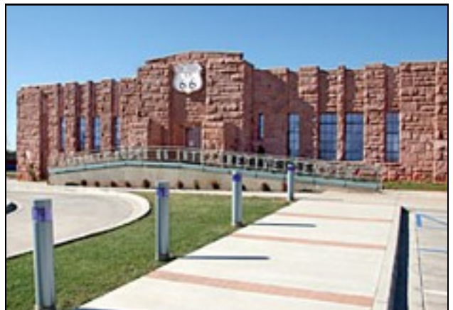
Route 66 Interpretive Center in Chandler, OK