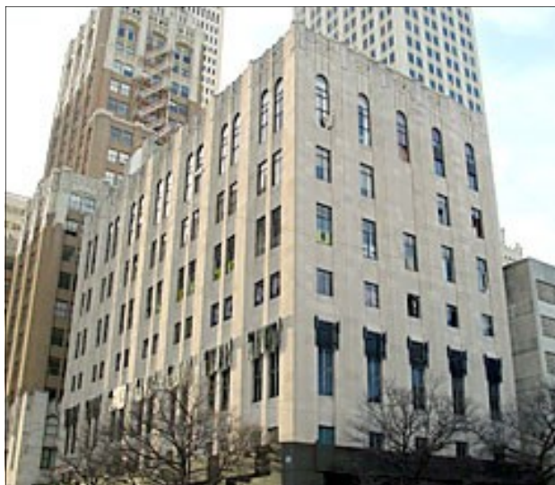
Tulsa Club Building, Tulsa.

The first African American educational institution in Oklahoma City, Douglass High School occupied several locales before moving into the old Lowell School, where numerous community leaders taught and learned. Douglass was converted to Page Woodson Fifth Grade Center in 1954 and served in that capacity until 1994, when it closed permanently. This Oklahoma City landmark may be lost if action isn't taken soon.