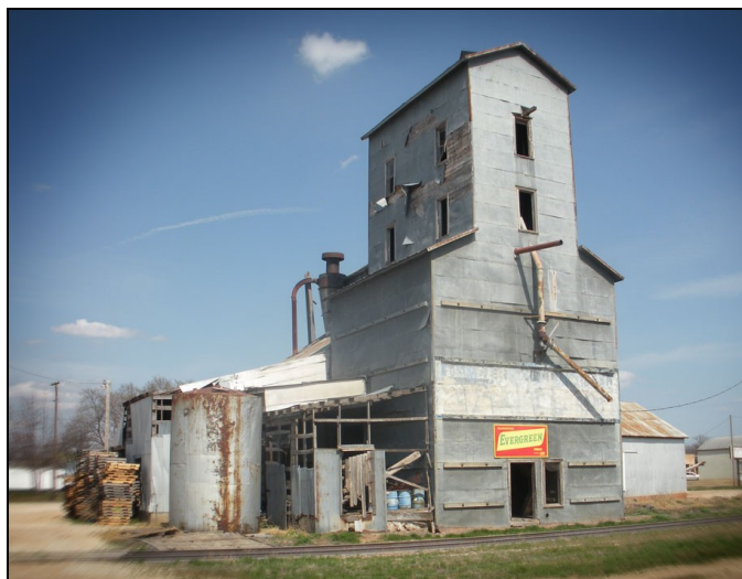
Grain Elevators/Morrison Grain.

In numerous agricultural communities, grain elevators represented the commerce and enterprise of bucolic Oklahoma. Changes to the agricultural economy and localized downturns have led to the neglect and imminent loss of many of these pastoral structures.