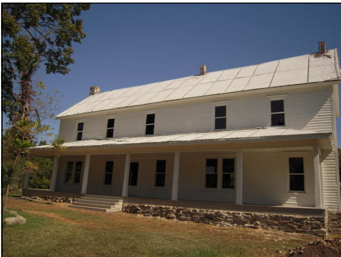
Saline Courthouse in Rose, OK.

The workshop will be held May 14 in Chandler at the Route 66 Interpretive Center in the restored Old Armory Building on Route 66. While the focus is on Route 66 communities, anyone interested is welcome to attend! For more information about how to register for the workshops, please contact Preservation Oklahoma at 405/525-5325 or email preservationok@preservationok.org or visit www.preservationok.org .