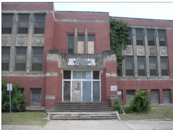
Former Douglass High School, Oklahoma City.