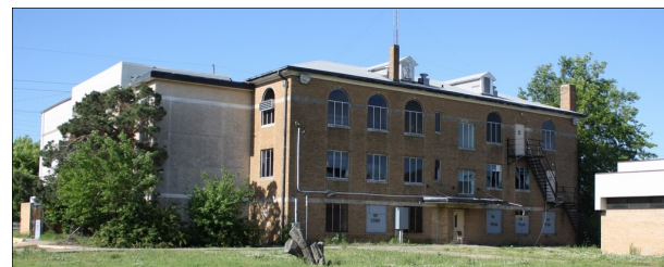
Morton Health Center, Tulsa.

Community hospitals provided care for countless individuals and deserve recognition and protection for their history. Examples of former hospitals in need of care are the Eastern State Hospital, Vinita, and Morton Health Center, Tulsa.