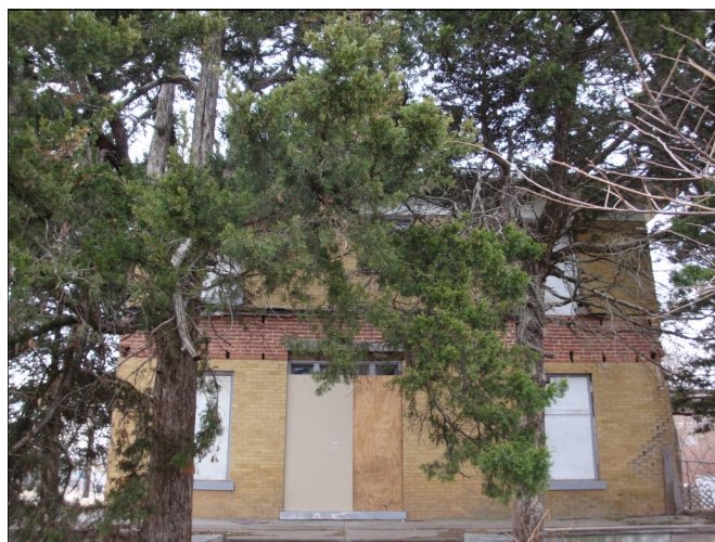
1600 NW 16th, Oklahoma City.

Emblematic of countless historic homes across Oklahoma and the nation, this home reveals the trials that face preservation efforts, even when the property is located in a National Register District. Despite the resurgence of the nearby Plaza District, and a good deal of preservation going on in surrounding areas, there are few safety nets in place to catch such a charming, but tragically typical, historic home.