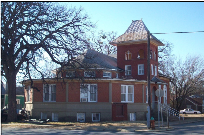
First Presbyterian Church, Atoka (left) and Archeological Sites Statewide/Rose Hill Plantation, Hugo vicinity (right), both on this year's endangered list.