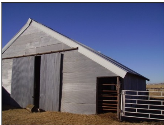
Leske-Seamands-Von Tungeln Barn, 1894.

The VonTungeln's barn is located on their farm just west of Fort Reno on Historic Highway 66. Donna VonTungeln says, "The barn was built by my Great Uncle Charles Leske who migrated from Iowa. The barn was built the same time as the house in 1894." Five generations of Leske-Seamands-VonTungeln's have lived in the historic home and the barn still provides protection for equipment and livestock. After the vertical wood siding and wood shingles deteriorated the barn was covered with sheets of metal. Hewn posts on the interior of the hay barn along with its dirt floor still allow space for equipment storage and livestock shelter. The Centennial Farm Award was given to the Leske-Seamands-VonTungeln Farm in 1999.