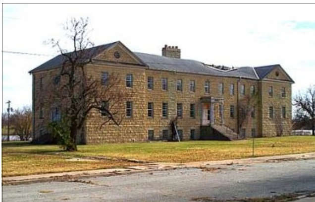
Chilocco Indian School, Kay County.

Chilocco Indian School was established in 1884 as one of the initial large, off-reservation federal boarding schools intended to assimilate Native American youth. Closed as an educational facility since 1980, Chilocco is currently under consideration as a National Historic Landmark but also requires serious attention to the campus grounds.