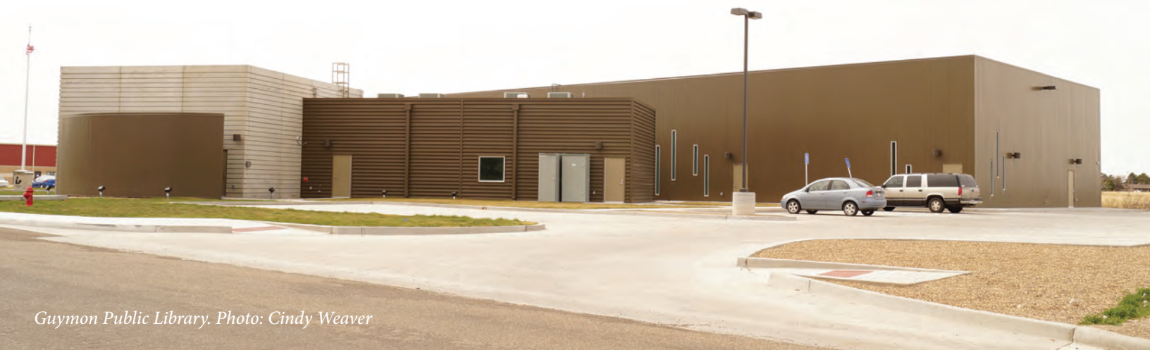
Guymon Public Library.

The Oklahoma Historical Society, State Historic Preservation Office, is pleased to announce its May workshop series. The sessions will be held May 7-9, 2014, at the Guymon Public Library Conference Room, 1718 N. Oklahoma, Guymon. Proceeding north on Main Street (Hwy 64), turn left onto 24th (Tiger Blvd) and continue to Oklahoma; turn left onto Oklahoma and proceed 0.2 mile to the library (on your right).