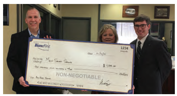
Stroud Presentation.

To learn more or to request an application, contact Preservation Oklahoma at 405/525-5325 or david@preservationok.org.