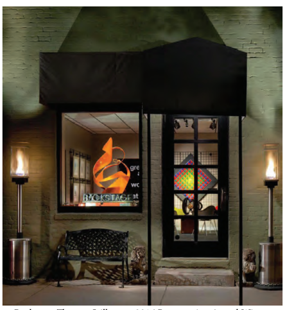
Backstage Theater, Stillwater, 2016 Preservation Award Winner

Four awards will be given: Rural Private Sector, Rural Public Sector, Urban Private Sector, Urban Public Sector. Nomination forms are available online at www.preservationok.org or by calling 405/525-5325. Nominations are due by May 5. The Preservation Awards will be presented at Preservation Oklahoma's Annual Luncheon held at the Statewide Preservation Conference in Oklahoma City on June 9.