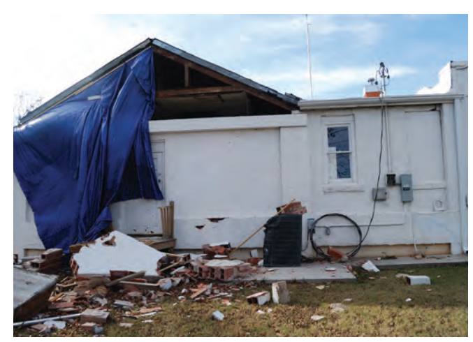
Rear, Cushing American Legion Building.

For information on disaster preparedness plans, see the Oklahoma Department of Emergency Management (https://www.ok.gov/OEM/) or the American Red Cross (http://www.redcross.org/get-help/prepare-for-emergencies/be-red-cross-ready/make-a-plan).