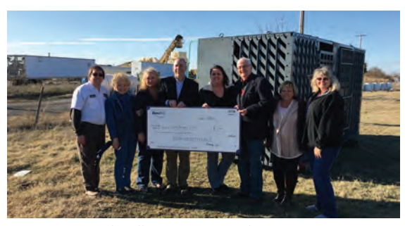
Chandler Presentation.