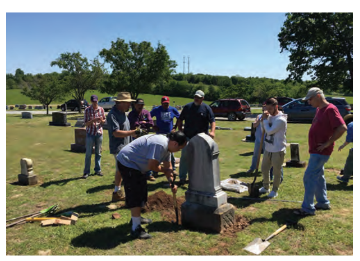
2016 Workshop, Tahlequah.

Please contact Preservation Oklahoma at 405/525-5325 or visit www.preservationok.org for more information and to register for the workshop; space and supplies are limited.