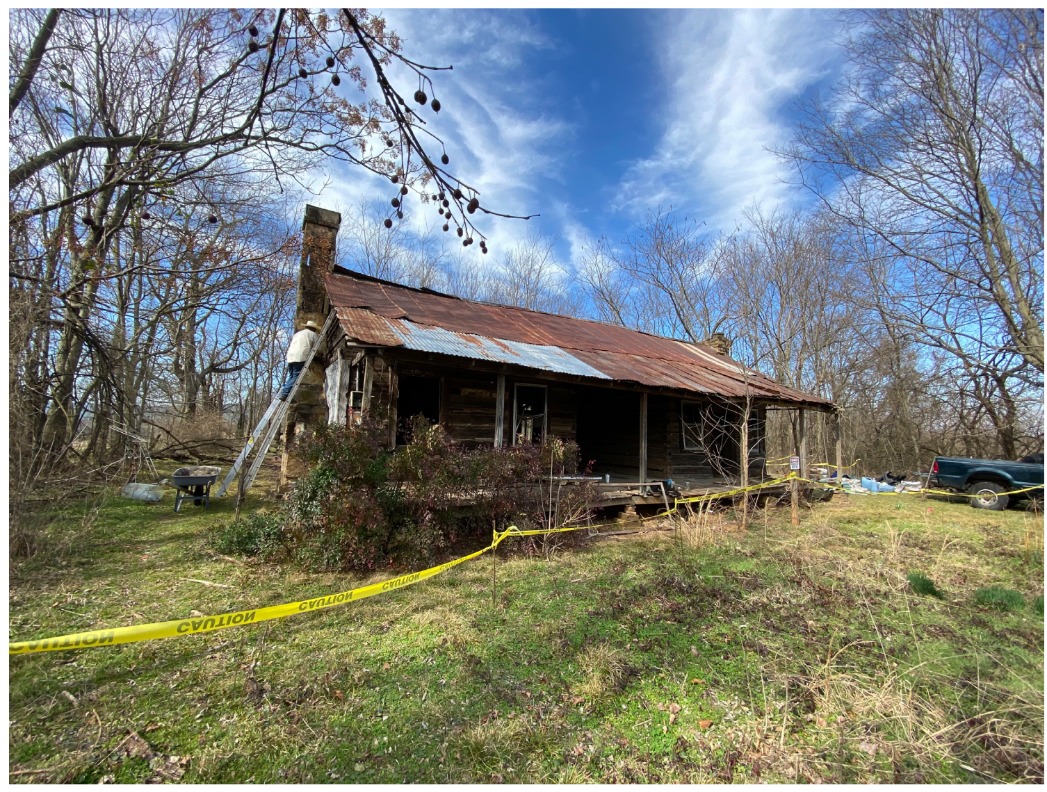
Edwards Store, Photo: POK