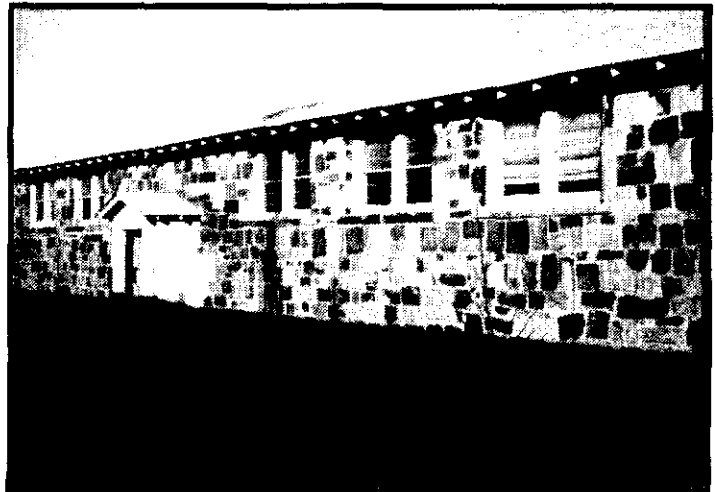
The Old Moss School Gymnasium: one of the state's many threatened historic public school resources