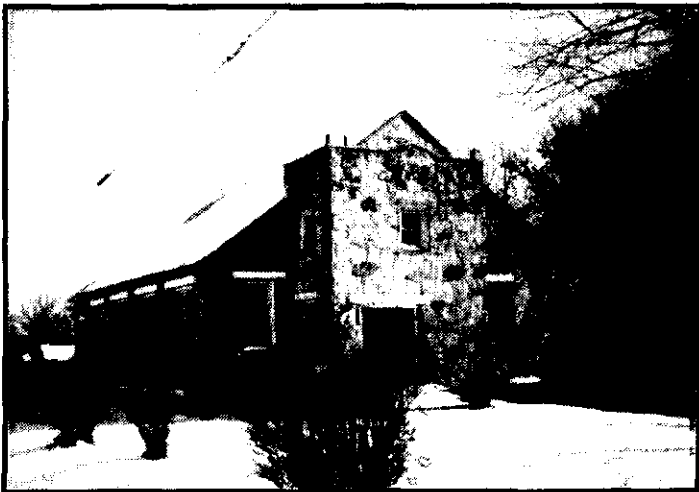
The Kimbrough/AME Church in Ponca City

Previously included on the Most Endangered List, the Old Stroud School at West 7th and Old Stroud Road in Stroud, Lincoln County returns to the 2001 list because of its current precarious situation. A Works Progress Administration project built in 1937 out of local materials, it served as the original Stroud High School until the current high school's construction. On May 3, 1999, a series of extremely powerful storms cut wide swaths of destruction across Oklahoma. The tornado that hit Stroud tore off part of the Old Stroud School's roof and did extensive structural damage to the interior. In 2000, Preservation Oklahoma secured funding through the National Trust for Historic Preservation to hire a structural engineer to determine if the building could be salvaged. Thanks to this action, as well as the efforts of local preservationists and the Lincoln County Historical Society, the Oklahoma Turnpike Authority expressed willingness to quick-claim deed the property free and clear to an interested historic preservation organization. Unfortunately, state statutes disallow transfer of state property to a non-governmental entity. Unless a county or municipal government is willing to act as an intermediary, the transfer will not occur and the building will eventually be demolished. The Old Stroud School was listed on the National Register of Historic Places in 1997.