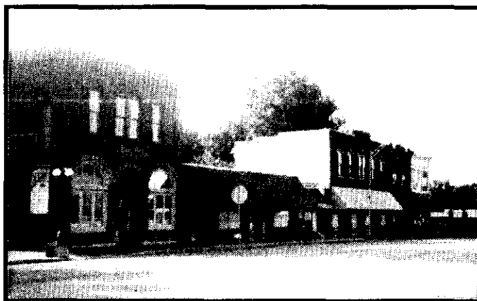
Historic Buildings in downtown Perkins