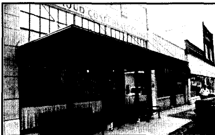
The Mensch Building in Stroud