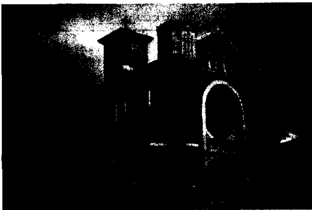
The Cathedral of Our Lady of Perpetual Help, 3214 N. Lake, in Oklahoma City. Conner Center, site of February 18 Preservation Oklahoma presentation, is located nearby.