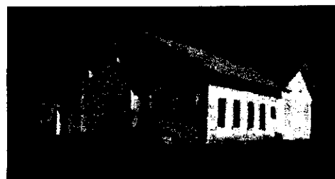
St. Paul Baptist Church, near Meeker