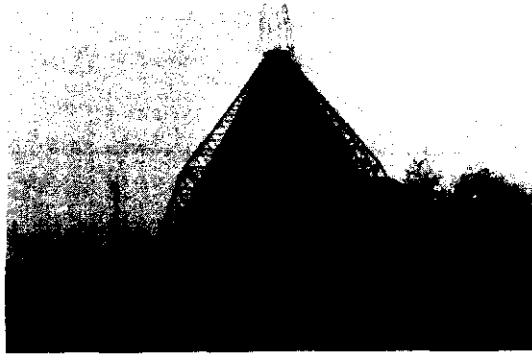
Hopewell Baptist Church

Oklahoma's Most Endangered Historic Properties List is a shared program with the Oklahoma Historical Society's State Historic Preservation Office. This program includes an exhibit and lecture series that will tour throughout the state on a monthly basis to increase awareness and education of endangered historic resources across Oklahoma. Registered architects will earn AIA/CES Learning Unit Hours for attending this event,