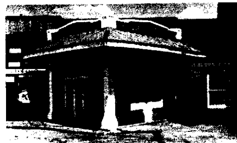
The Marland Filling Station, Hominy

The Sapulpa Downtown Historic District comprises the heart of commercial activity in the Creek County seat. Bisected by historic Route 66, construction in the downtown area rode the wave of oil that flowed from the nearby Glenn Pool. The collection of buildings in this Main Street community represents the importance of oil to the city.