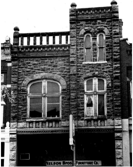
Foucart Building, Guthrie