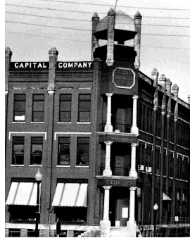
State Capital Publishing Building, Guthrie

Built in 1890, this stone building at 115 West Harrison housed Foucart's office in its third floor tower. The elliptical arch windows, balustraded parapet, and quarry-faced sandstone walls give a hint to the decorative touches typical to a Foucart design.