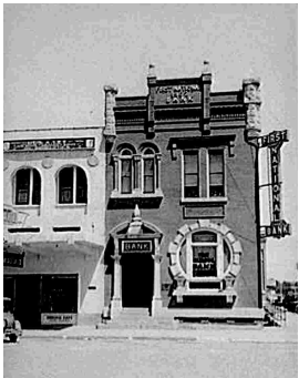
First National Bank, Perry

One of Foucart's few residential commissions, the 1895 Heilman House, in form, differs little from the typical Queen Anne style house of the era. It has asymmetrical massing and an offset tower; it is the details, though, that mark it as a Foucart design. The house is masonry, with quarry-faced stone on the first floor and brick on the second. The second floor windows have stone lintels. Foucart favored mixed masonry. Two elements of the house are distinctive to Foucart – the Russian dome atop the tower and the round arched window. Foucart carries the arch 270 degrees, well beyond the typical half-circle of most round arches.