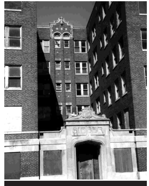
Sieber Grocery & Apartment Hotel