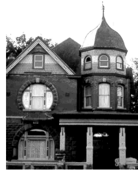
Heilman House, Guthrie