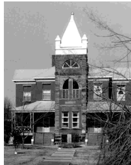
IOOF Widows & Orphans Home, Checotah

Located on the east side of the courthouse square in Perry, the First National Bank was completed in 1902. The red brick building had stone finials and the distinctive arched window typical to Foucart's work. In the Perry bank, the window has a dressed limestone surround with a projecting sill that gives the window opening a keyhole look.