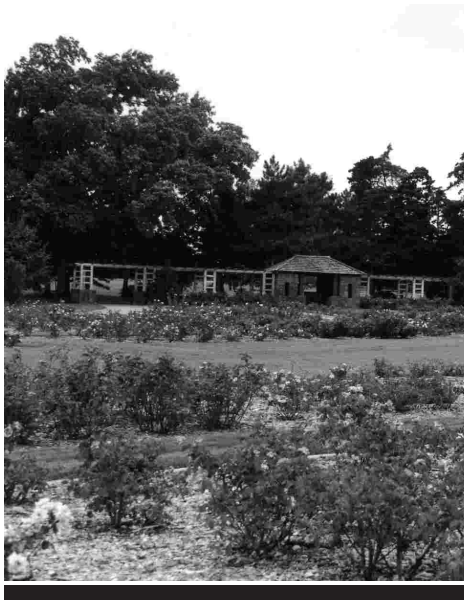
Will Rogers Park Gardens & Arboretum