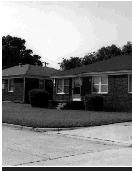
Edwards Heights Historical District