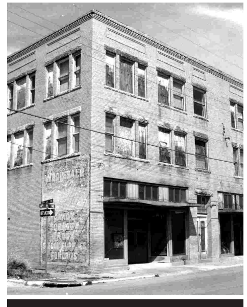
Ardmore Historic Commercial District