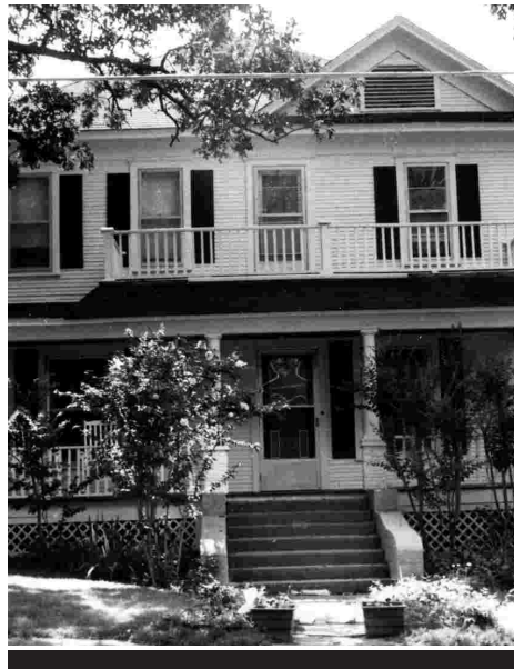
Leonard Logan House