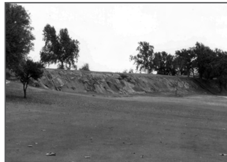
Dornick Hills, Ardmore