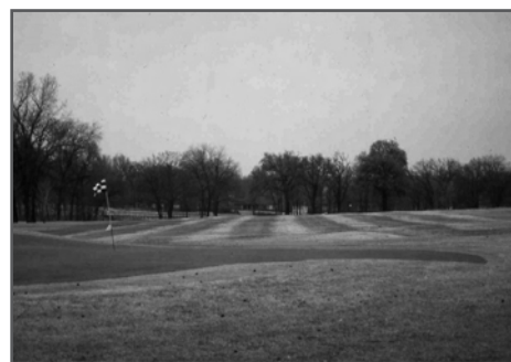
Muskogee Country Club, Muskogee