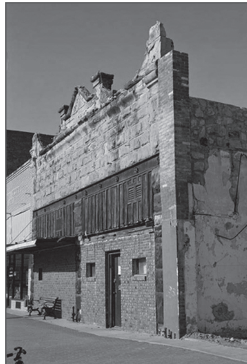
Stag Bar, Ardmore