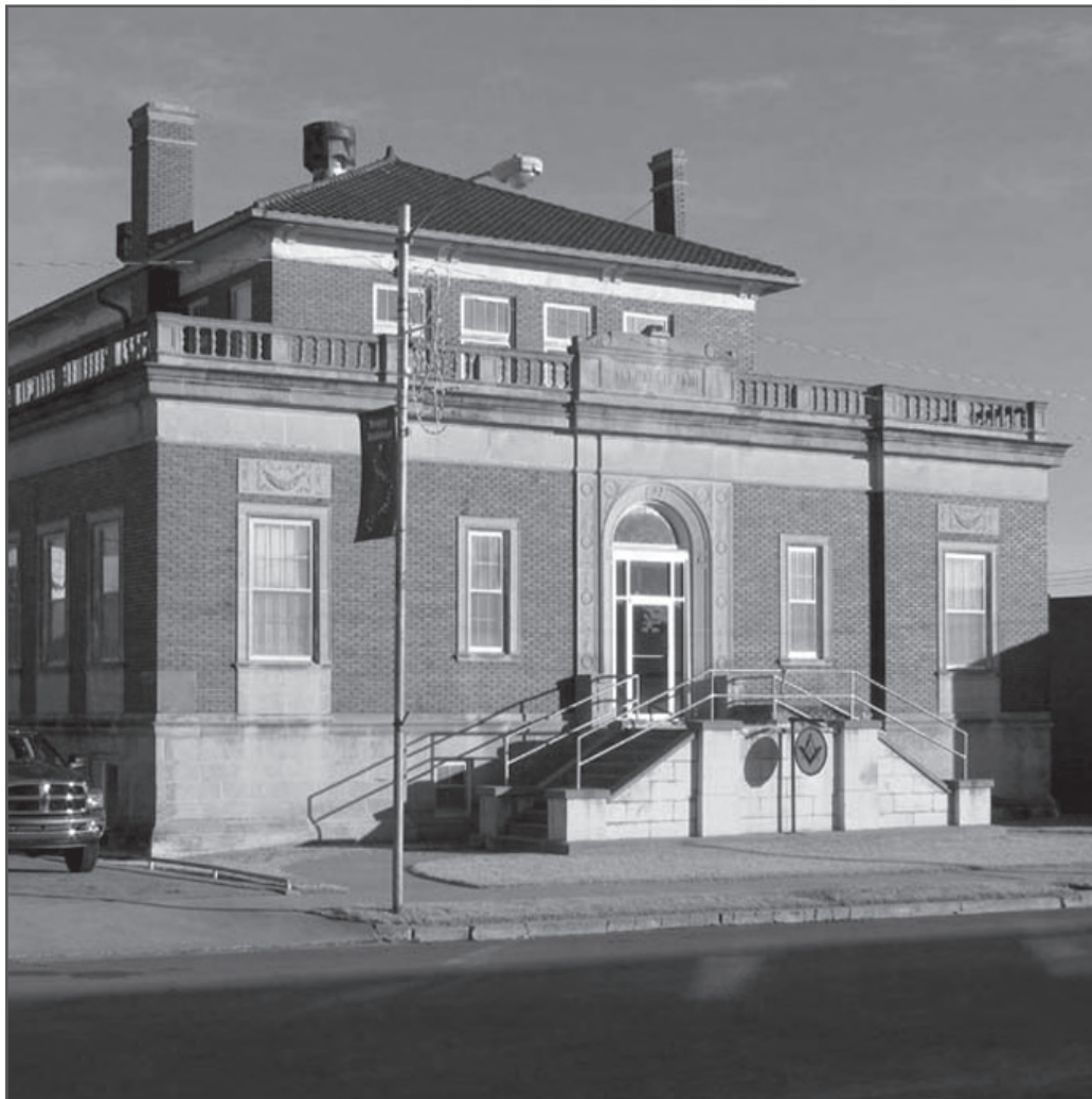
Masonic Lodge, Tonkawa