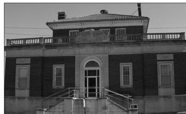
Masonic Lodge, Tonkawa