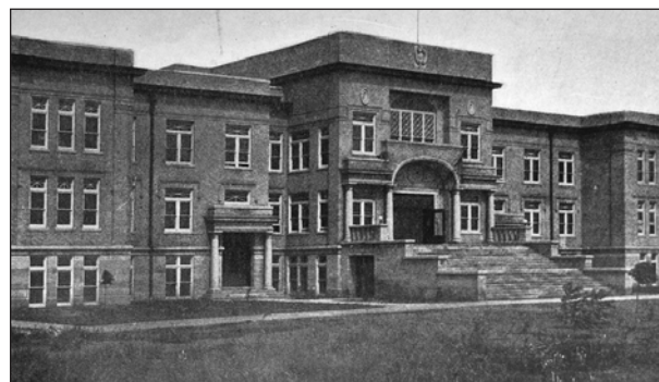
Administration Building, Oklahoma College for Women