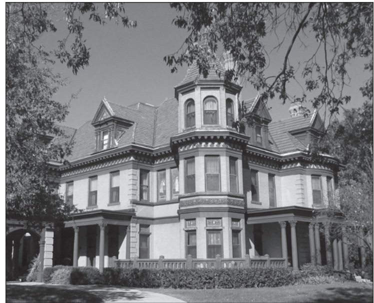
The Historic Overholser Mansion

Today, the mansion comprises one of the richest collections of original furnishings in the nation and draws thousands of visitors each year.