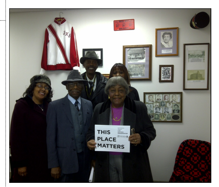
This Place Matters Tour participants at the Boley Historical Museum (see article above).

Please join us for a fun evening of music, food and drink, and a silent auction, and see the inside of the historic Buick Motor Building in downtown Oklahoma City. (Read all about this recently restored property on page 4 of this newsletter!) For more information or to purchase tickets, please call Preservation Oklahoma at 405/525-5325 or email us at preservationok@preservationok.org.