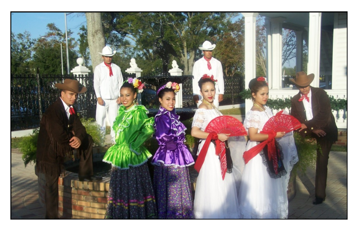
The sites and festivities of Guymon, OK

Save the dates, June 8-10, 2011, for Wide Open for Preservation: Oklahoma's 23rd Annual Statewide Preservation Conference in Guymon.