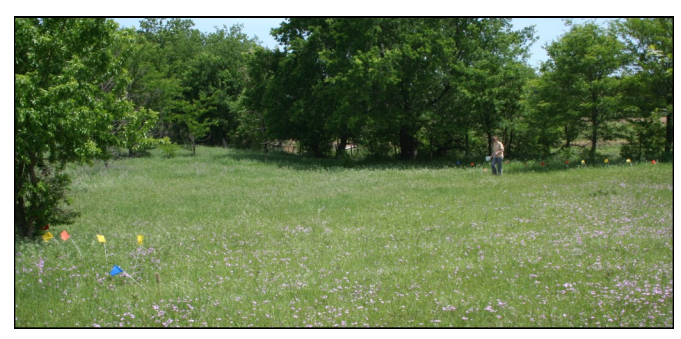
Archeological Site near Red River Basin.