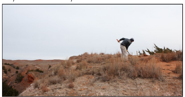
Archeologists at work at the Four Canyon Nature Preserve.

Leland Bement, OAS, received an HPF grant to place several test units in three sites (34EL176, 34EL183, and 34EL191) that were identified during the 2008 archeological survey of the Four Canyon Nature Preserve administered by