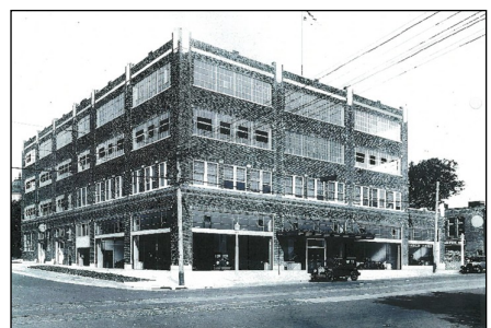
Historic Image of Buick Motor Building.

In 1999 the Automobile Alley Historic District in Oklahoma City was added to the National Register of Historic Places. Since that time over a dozen buildings within Automobile Alley have been successfully rehabilitated and certified for the