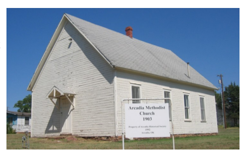
First United Methodist Church, Arcadia

For additional information about the PlanFirst grant program, please contact Preservation Oklahoma at 405-525-5325 or visit www. preservationok.org.