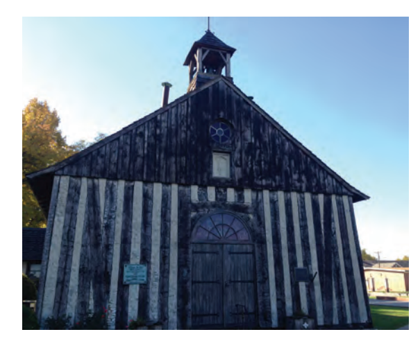
Church of the Holy Family.

Driving less than a mile east of the church, I stopped to visit a simple home among a row of other simple homes. It doesn't stand out, has no distinctive features, but to me it has a significant history - it was the home of my grand-parents. As I viewed it across the street, I didn't see the new siding and windows or the roof that needed repairing - instead I saw the front window under which my dad and his dad used to talk. I saw the porch, albeit much smaller than I remembered, where my grandmother used to sit on her glider as she snapped beans.