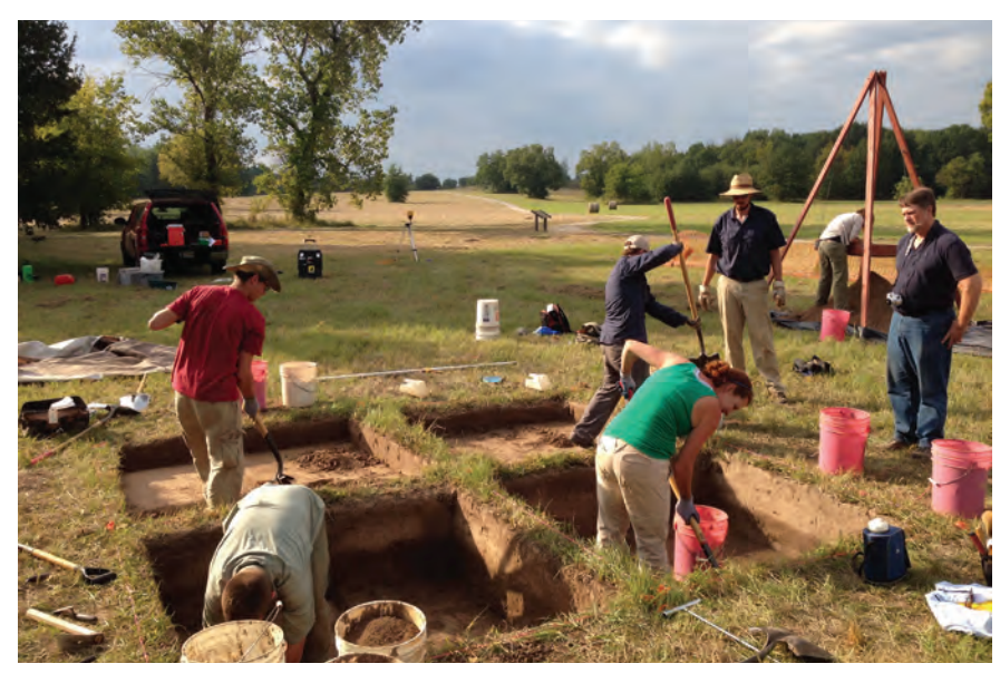
Archaeologists digging excavation units.

The Spiro site is owned by the US Army Corps of Engineers, Tulsa District, and in consultation with the State Historic Preservation Office, the Caddo Nation and the Wichita and Affiliated Tribes of Oklahoma, in accordance with Section 106 of the National Historic Preservation Act, it was determined that the erosion from the creek represented an adverse effect to these potentially significant features at the Spiro site.