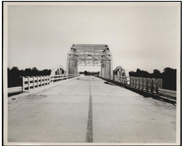
Verdigris River Bridge, 1945, Wagoner County