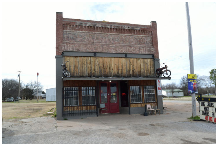
Harris Palace Store, Byars, Photo: SHPO