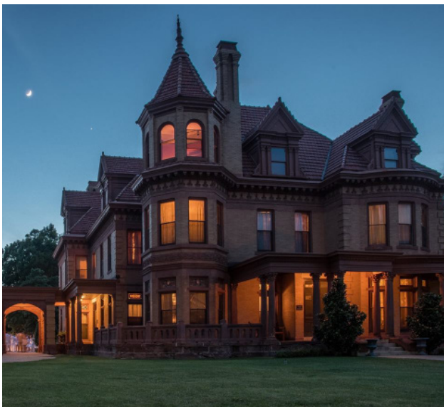
Henry Overholser Mansion, Oklahoma City