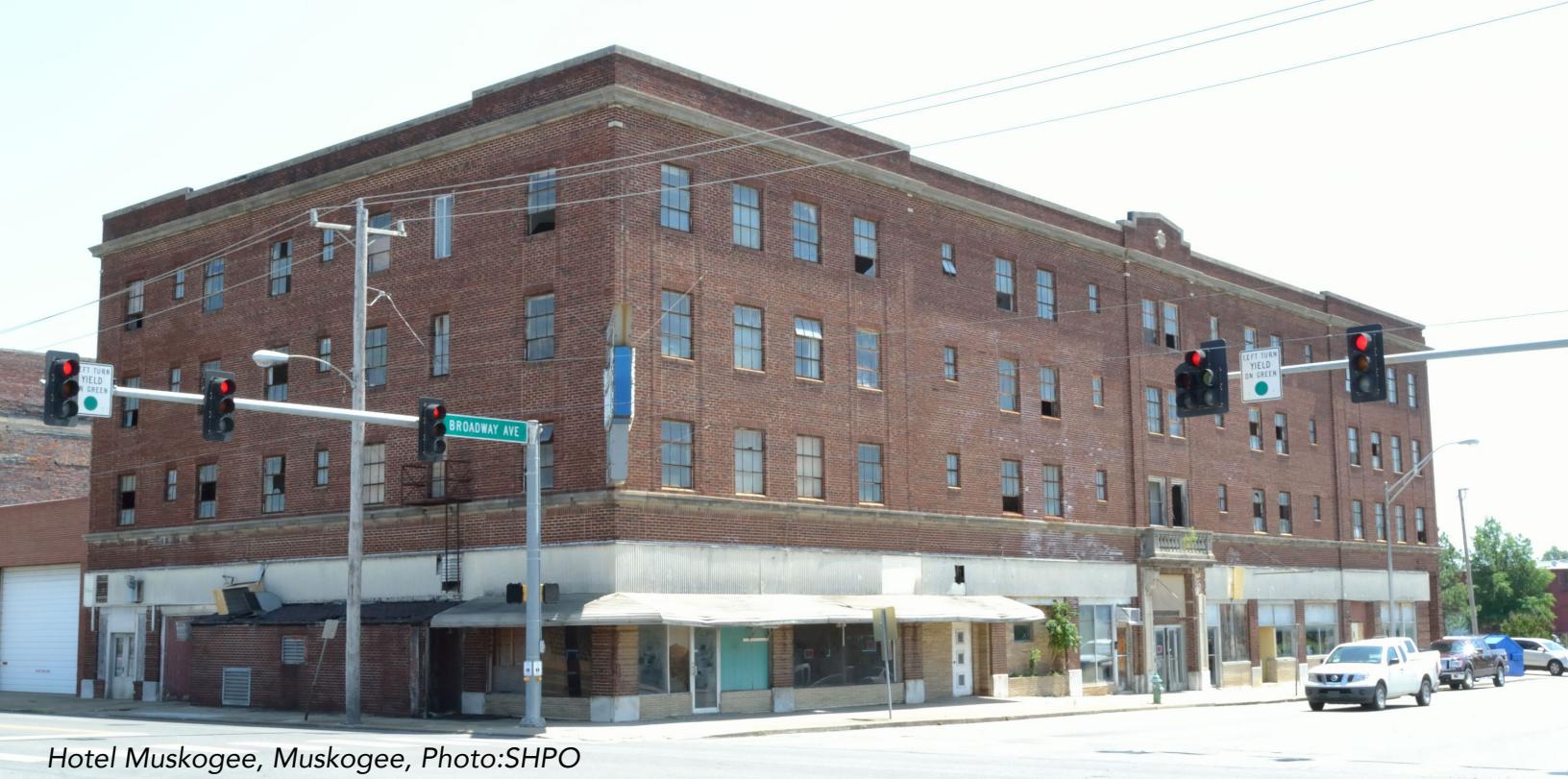
Hotel Muskogee, Muskogee