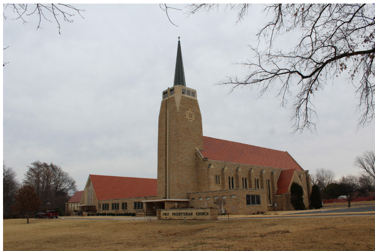
First Presbyterian Church, Ponca City

All of the nominations can be found by visiting: http://nr2_shpo.okstate.edu/ .