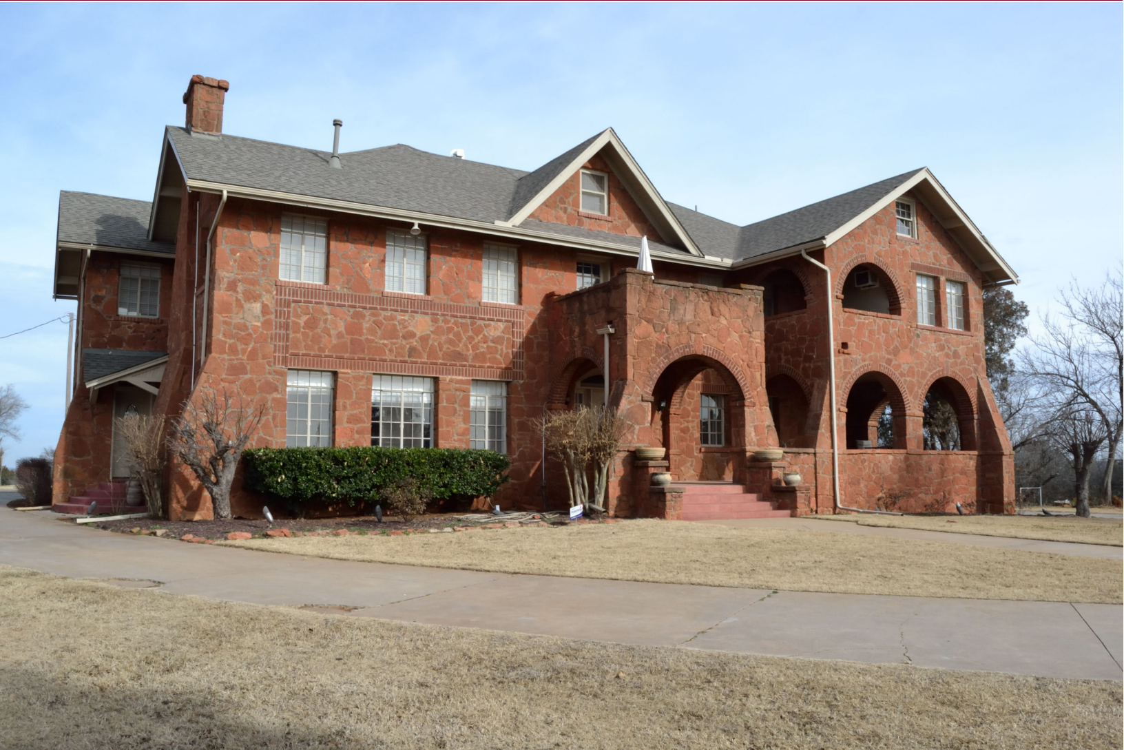
Slaughter House, Oklahoma City