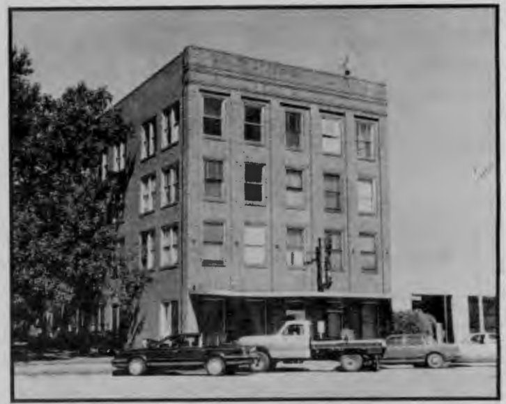
Hotel Cherokee in Cherokee, Alfalfa County

The Hotel Cherokee was listed on the National Register for its commercial and architectural significance to the town of Cherokee in Alfalfa County. The hotel represents the physical legacy of commercial development and the link between transportation and commerce in Cherokee during the 1929-1947 period. Built in 1929, the four-story, Commercial Style hotel is the largest and most elaborate building of its kind in Cherokee. Virtually unaltered, the hotel retains a high degree of integrity. The building is now owned by the Alfalfa County Historical Society and operated as the Alfalfa County Museum. The Alfalfa County Historical Society received a $500 matching grant from the SHPO to hire Dr. Dianna Everett to prepare the nomination.