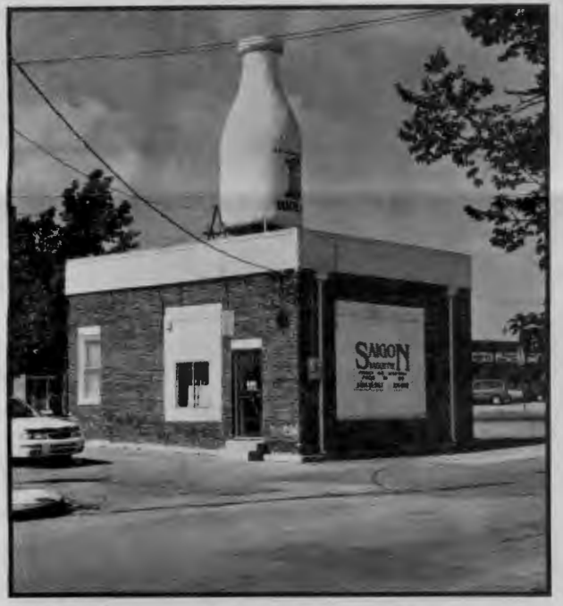
Milk Bottle Grocery Building in Oklahoma City

A longtime Oklahoma City landmark, the Milk Bottle Grocery was listed on the National Register for its architectural significance. The Milk Bottle Grocery was deemed significant as an unusually small and distinctive, triangular, lot-shaped building and for the giant, carefully executed and preserved milk bottle on its roof. The small, triangular shaped, Commercial Style building was constructed in 1930. The milk bottle, an outstanding example of advertising as an overtly outsized sculptural form, was added in about 1948. The nomination was prepared by Jocelyn Lupkin.