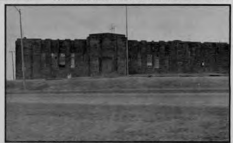
National Guard Armory on Route 66 in Chandler

Nominated by Lincoln County Historical Society, this building, originally on our 1995 Most Endangered List, moved to the Watch List in 1997. In their new nomination, the Lincoln County Historical Society reported that city officials were discussing possible demolition and had solicited a bid. Since then, Preservation Oklahoma has learned that the City of Chandler was negotiating with O'Reilley's Auto Parts, which was looking at locations in Stroud and Chandler for a new location. The City had