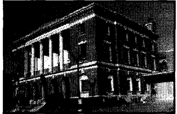
The McAlester Federal Building

Each was also nominated for its architectural significance to its community. All utilize the Classical Revival architectural style. The Lawton, Muskogee, and Tulsa buildings feature smooth limestone exteriors with impressive colonnades that dominate the facades. The McAlester building is yellow brick and features an arcaded entry at the ground level and in antis Corinthian columns on the main level.