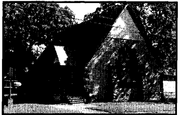
St. Stephen's Episcopal Church in Chandler

Saint Stephen's Episcopal Church in Chandler, Lincoln County, might look more at home in the English countryside. This 1899 building is constructed of buttressed stone walls and features a steeply pitched, gabled roof and simple gothic-arched windows. The interior includes original oak benches and pulpit and an interesting open roof truss system. The late Gothic Revival style building is now a Seventh Day Adventist Church.