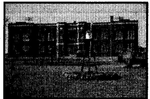
Thomas High School graces Custer Co., but for how much longer?

"The most interesting part of a project like this," said Elliott, "is blending the elements of a building that give it historic integrity with the requirements of today's technology, e.g.: THX Sound and state of the art film projection/viewing systems. It's just a classic example of modern ingredients in an historic building and how well that can work."