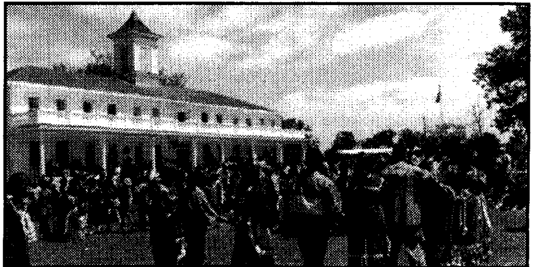
A recent celebration at Wheelock included Choctaw dances in front of Pushmataha Hall.

The focal point of the campus is Pushmataha Hall, the old seminary building, which is threatened by the structural failure of the west wall of its north wing. Since 1992, the Department of the Interior has listed Wheelock Academy as a Priority 1 (threatened) on the National Historic Landmark Status Report. When Preservation Oklahoma, Inc., began its annual list of Oklahoma's Most Endangered Historic Properties in 1993, it included Wheelock Academy, which has been on the list every year since. Oklahoma's Most Endangered Historic Properties is a joint project between Preservation Oklahoma and the Oklahoma Historical Society's State Historic Preservation Office.