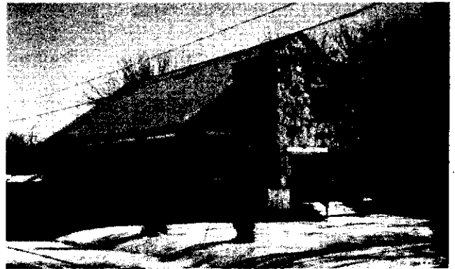
Ponca City's C.M.E. Chapel on South 12th is also on "Oklahoma's most endangered properties"

Here is a summation of the properties and