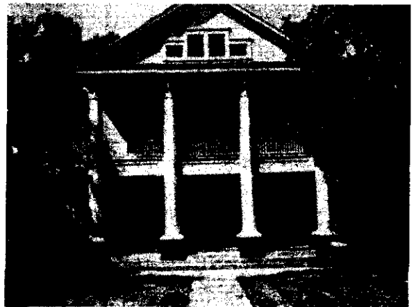
The Meyers Mansion, located in Ft. Towson, was built in 1903 as a wedding gift to a bride and continues to be a livable property.

Finally some truly good news. Demolition of