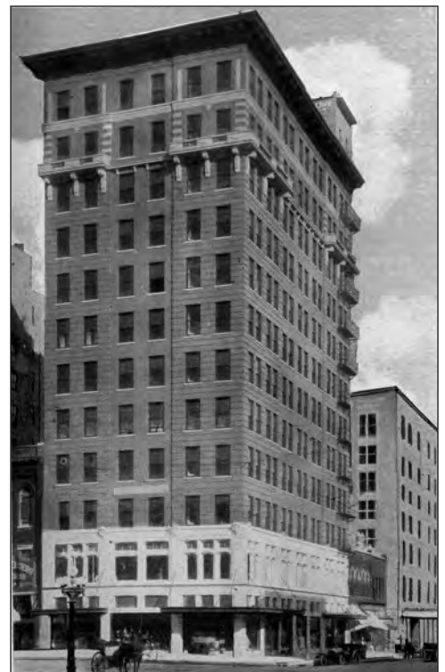
Herkowitz Building, Oklahoma City

Ibid., 12 July 1908, 22 April 1910 and 10 December 1910.