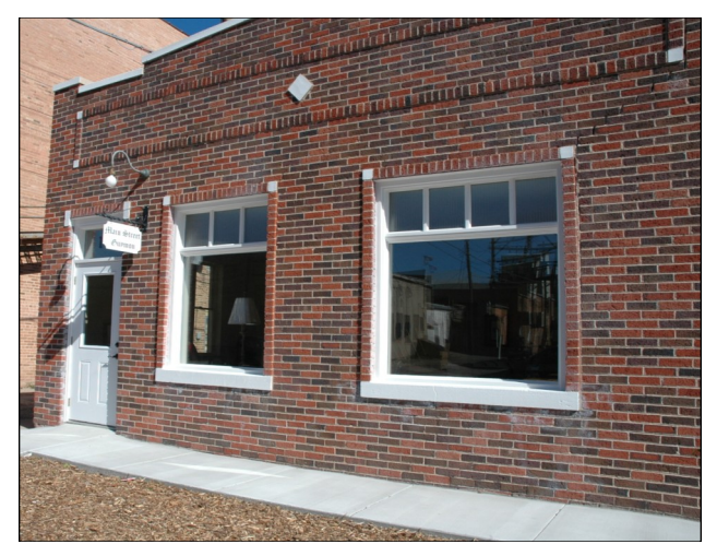
Award Recipients Guthrie First United Methodist Church and Guymon Main Street headquarters.

The Oklahoma Historical Society's State Historic Preservation Office presented its 2011 Citations of Merit during an awards banquet in Guymon on June 9, a highlight of Wide Open for Preservation: Oklahoma's 23rd Annual Statewide Preservation Conference. Recipients have contributed to the preservation of Oklahoma's significant archeological and historic properties through research, public programming, restoration/rehabilitation, and other activities. Recipients and their projects included: