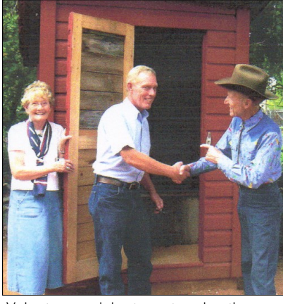
Volunteers celebrate restored outhouse.

Society, who then moved it to the rear of the Round Barn site. Volunteer labor and guidance from Arcadia carpenter Jimmy Blue restored the outhouse, repairing and replacing wood, repainting, and installing a door. The outhouse now educates and entertains visitors to the Round Barn and Route 66 in Arcadia.