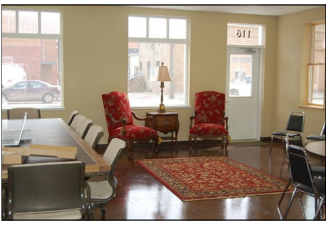
Before and after interior of Guymon Main Street Office.