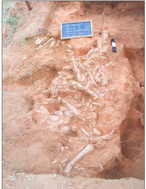
Jake Bluff Bison Processing Pile.

The Jake Bluff bison kill provides new avenues for studying aspects of Clovis hunting organization. This in-