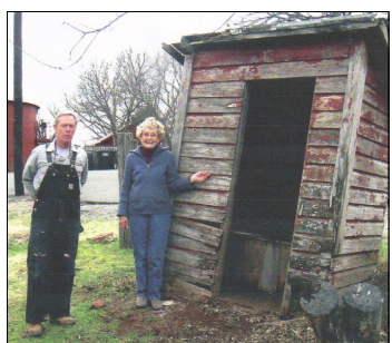
Outhouse before restoration.

The Arcadia Round Barn historic site has a new exhibit, a restored "two-holer" frame outhouse which is drawing interest from tourists.