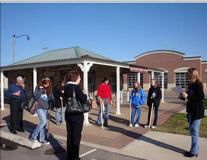
Participants on a This Place Matters Tour, Durant.

2012 marks the twentieth anniversary of the creation of Preservation Oklahoma. In each newsletter this year we will feature a different article on Preservation Oklahoma's history as an organization. This month we will look at one of Preservation Oklahoma's more recent programs, "This Place Matters" events.