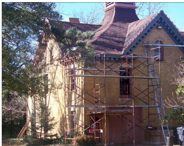
POK's Offices in the Overholser Mansion Carriage House, under restoration.

This fall, with generous support from the Kirkpatrick Foundation, Preservation Oklahoma plans to commemorate its 20 th anniversary with several events. A gala will celebrate all that's been accomplished, and a symposium will debate what is to be accomplished in the future. Watch your mail, email, www.preservationok.org , and October's Preservation Oklahoma News for further details.