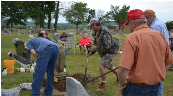
Participants level a fallen monument.