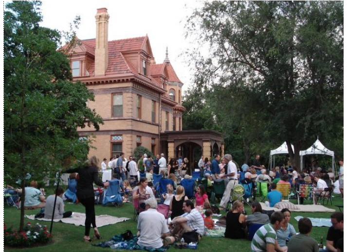
2011 Concert on the Lawn.

Enjoy performances by talented local musicians, with food and drinks provided by local restaurants and caterers. All proceeds will support the management and preservation of the historic Overholser Mansion. We hope to see everyone there! For more information, call 405/525-5325.