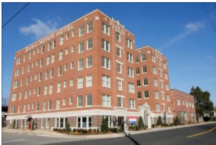
The Sieber Hotel, a Tax Credit Project in Oklahoma City.