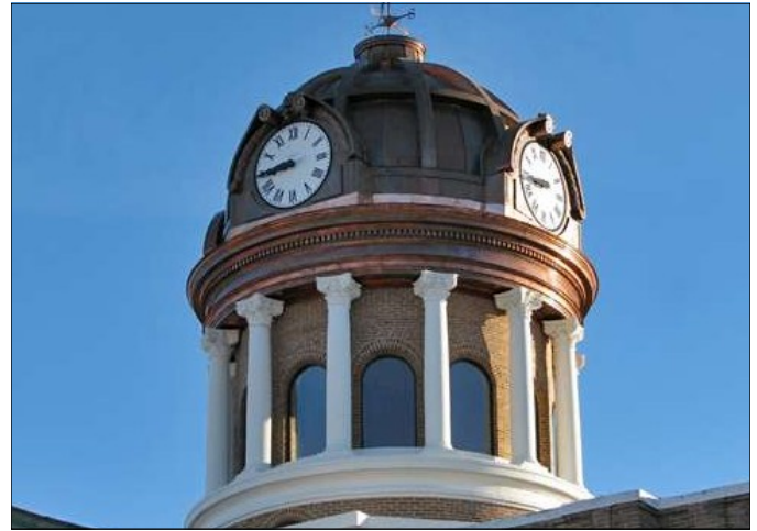
Bristow Body Shop (left) and Washita Courthouse Dome (right).

The Oklahoma Historical Society's State Historic Preservation Office annually presents its Citation of Merit to government agencies, organizations, firms, and individuals who have had positive impacts on the preservation of Oklahoma's significant historic properties. Accomplishments in archeological site preservation, research, publication, public programming, leadership, and restoration/rehabilitation work are recognized. The 2012 recipients were honored during the statewide preservation conference awards banquet in Tahlequah on June 7. Organized by city, they included the following: