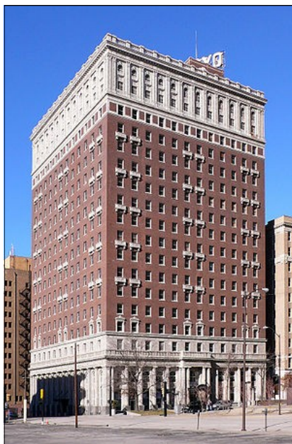
The Mayo Hotel, a Tax Credit Project in Tulsa.

Introduced in 2005, the Credit for Qualified Rehabilitation Expenditures allows property owners who rehabilitate National Register of Historic Places-eligible properties for use as public, for-profit entities to recoup a portion of their initial investment through tax incentives. It parallels a federal tax credit, therefore allowing up to a 20% state tax credit along with a 20% federal tax credit for a total of 40%.