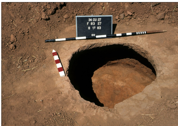
Heerwald Site, Clinton Vicinity.