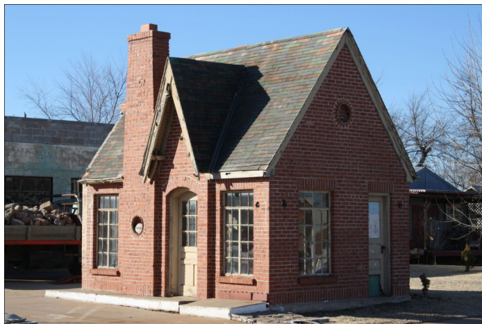
Phillips 66 Station, Chandler.

Phillips 66 Station No. 1423, 701 South Manvel, Chandler