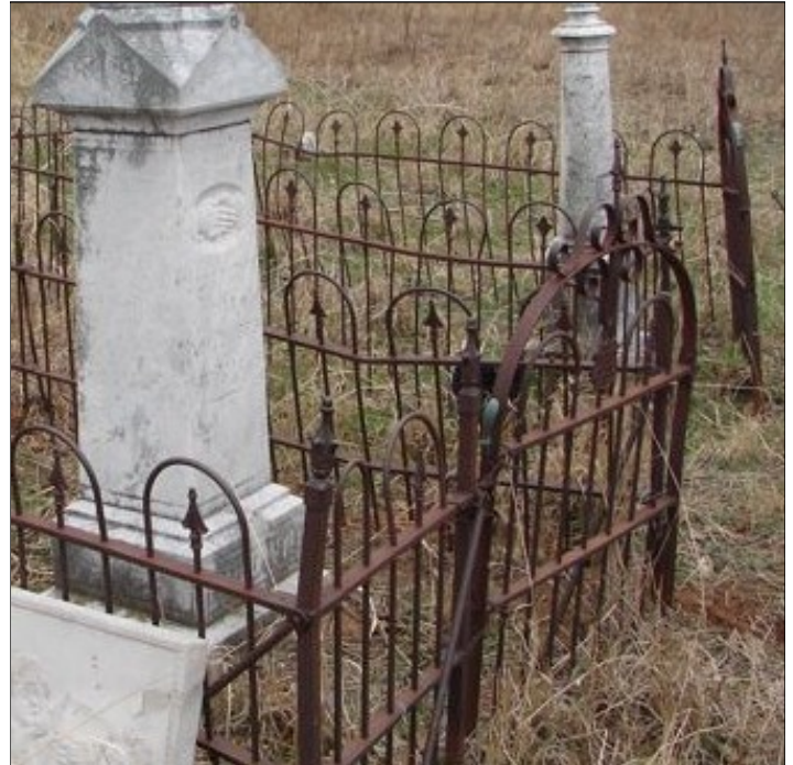
Graves at the Jack Brown Cemetery.

It is truly impressive that this group of students has shown such dedication to the care of the Jack Brown Cemetery.