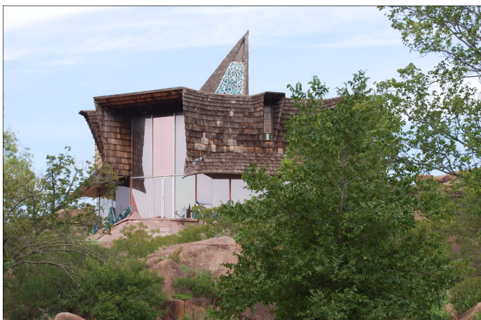
Joyce House, Snyder Vicinity.

Tulsa Civic Center Historic District, Between West 3rd & 6th Streets & South Houston & Denver Avenues, Tulsa