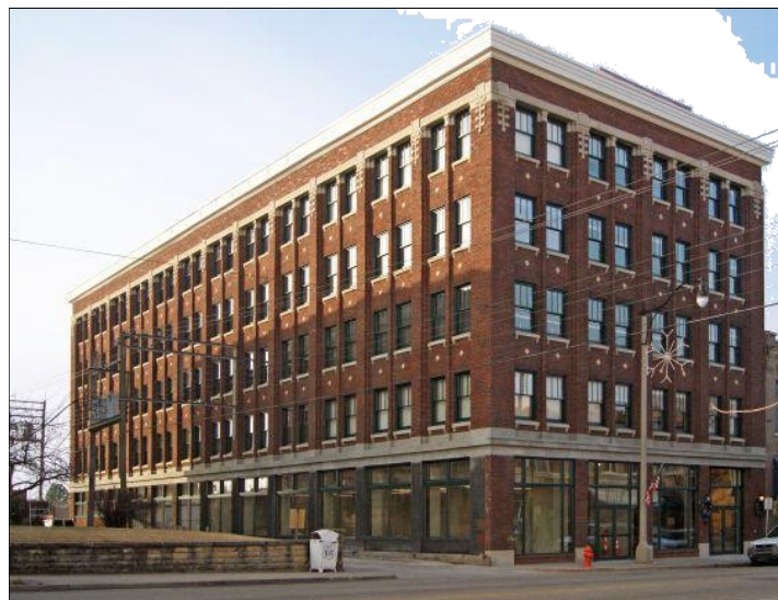
The Wells Building, a Tax Credit Project in Sapulpa. Photo: Sikes Abernathie Architects

As the Task Force continued its work, and as the Legislature began to propose and review bills, support remained strong for the rehab tax credit. Preservationists from across the state worked to educate their legislators about the impact the credit has had, and can continue to have, on communities large and small. Business leaders and organizations also voiced their support for the rehab tax credit, citing the commercial and economic successes across the state spurred by tax credit projects.