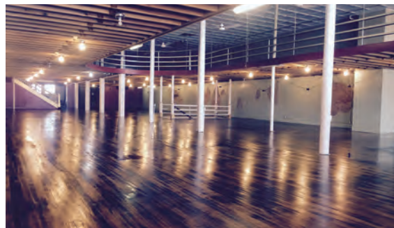
Broadway Antiques & Uniques.

On Friday, June 3, Preservation Oklahoma (POK) presented awards to two projects that demonstrated excellence in historic preservation. The event took place during POK's annual meeting and luncheon in the Independence Tower Ballroom in Enid. Preservation projects happen ONLY because of the efforts of local citizens across our state. Preservation Oklahoma would like to applaud the work of these individuals whose tenacity, courage, and determination are the backbone of successful preservation projects across Oklahoma. The following awards were presented: