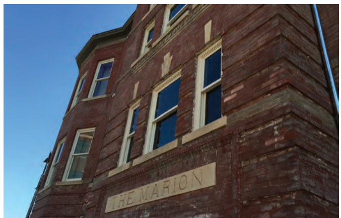
Marion Hotel, Oklahoma City