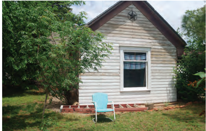
Meloy House, Mustang