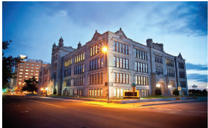
Oklahoma City University School of Law