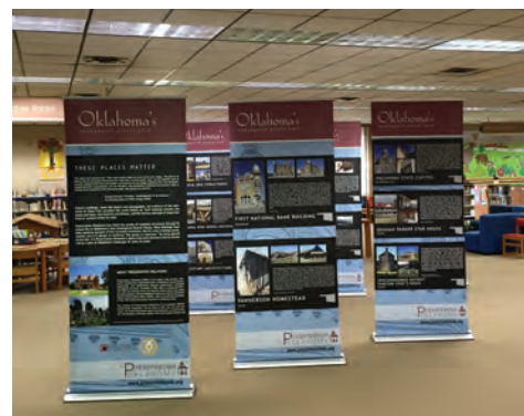
Endangered Places Exhibit at Altus Public Library.