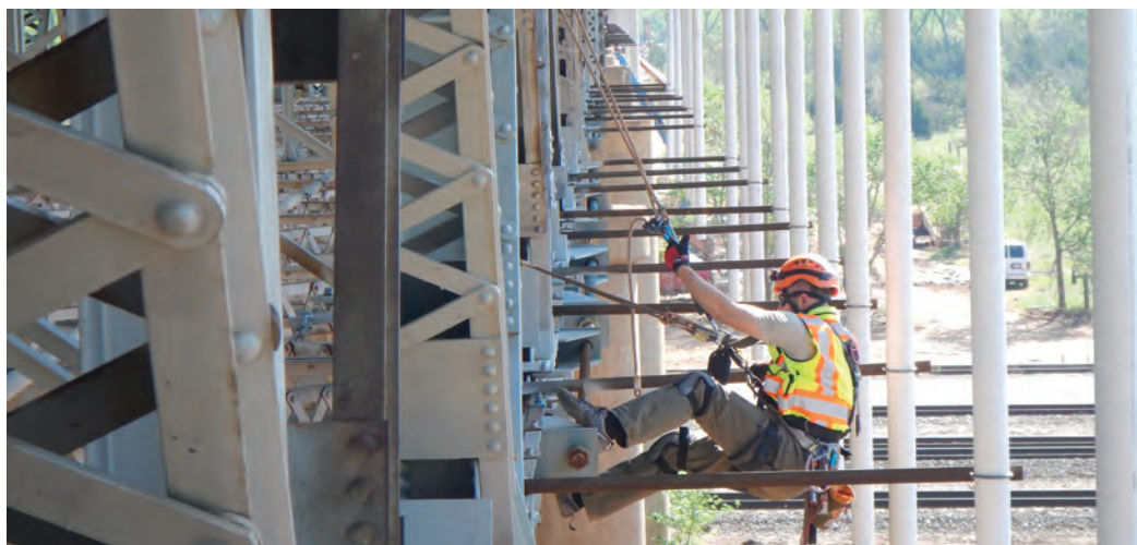
Inspection of historic James C. Nance Bridge.