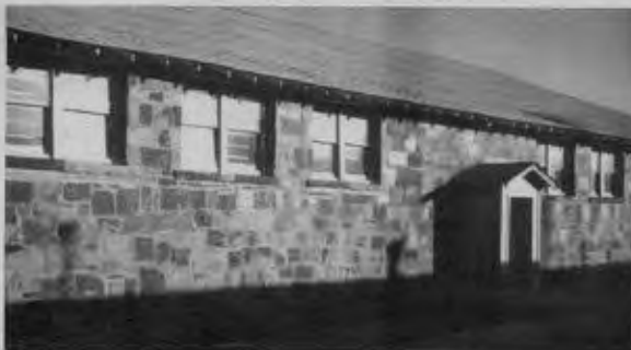
Moss School gymnasium – no longer standing.

A fire of undetermined origin destroyed the oldest home in Lincoln County, the National Register-listed Moses Keokuk House located six miles south of Stroud, four miles southeast of Davenport. Also completely destroyed in the fire was a wood frame residential home nearby. Only sections of the Keokuk house walls remain. The fire could have started from an electrical short in an interior power box or from a lightning strike during a powerful storm. The frame house was the home of a couple that had been married for over 70 years and their home not only contained all of their household goods, but furniture and family treasures collected over a lifetime. Although unoccupied at the time, the Keokuk House also contained family heirlooms and keepsakes. The 130-year-old brick house had been the former home of Chief Moses Keokuk and played an important role in the history of the Sac and Fox Nation in Oklahoma.