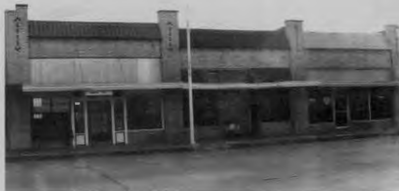
Grandfield Downtown Historic District