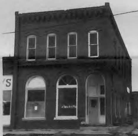
Bank of Nashville

The Bank of Nashville is a preservation success story in the making. One of the few commercial buildings left in Nash, the bank building had hosted a number of commercial concerns over the years. Recent years had seen the building fall into disrepair and threatened with demolition. The New Nashville Historical Preservation Association stepped in to save the building. Through their efforts, the building has been stabilized and rehabilitation has begun. The organization also sponsored the nomination of the bank to the National Register.