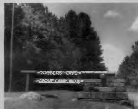
Robbers Cave State Park