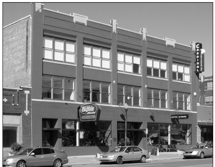
1015 Broadway

The total cost of the rehabilitation was $4.3 million. An estimated 30 construction jobs were created, and approximately 100 permanent jobs were created.