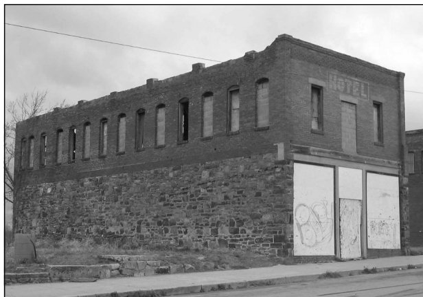
Downtown Boley

Please join Preservation Oklahoma for a This Place Matters tour of historic Boley on the afternoon of Friday, December 3rd. Boley is an historically all-Black town in central Oklahoma County. Founded in 1903 as a safe haven for African American railroad workers, the town boomed through the early 1900s with hotels, restaurants, and a Masonic Temple.