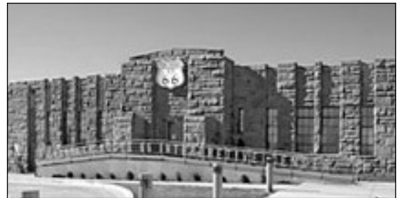
Route 66 Interpretive Center, Chandler

Preservation Oklahoma, Inc. and the Oklahoma State Historic Preservation Office will host two workshops this fall and next spring entitled Making the Most of the Mother Road: How to Care for (and Benefit from) Your Route 66 Resources .