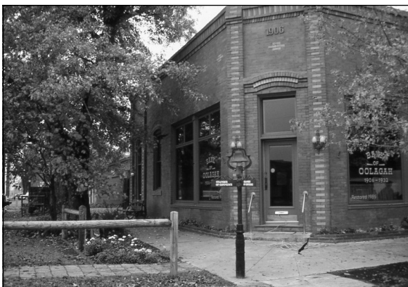
Oologah Bank

Situated in Rogers County, the community of Oologah is located at US Highway 169 and State Highway 88. Prior to statehood, Oologah emerged as a coal-mining boom town in Indian Territory. The community quickly became a shipping point for coal mined in the area. It also served as a center for mining camps and other associated industries.