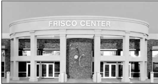
Frisco Center, Clinton