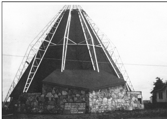
Hopewell Church, Edmond, Endangered 2010