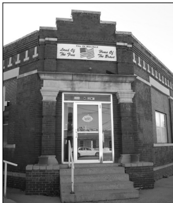
City Hall, Blanchard, Endangered 2009

3) Is the current property owner aware of this nomination? Yes _____ No _____