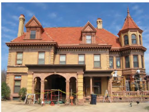
Exterior Restoration of the Overholser Mansion

For the past two decades, Preservation Oklahoma and the Oklahoma Historical Society have demonstrated that partnerships are critical to any successful preservation effort. Together, we have increased the public's awareness about Oklahoma's heritage, provided technical assistance through community workshops, partnered to host the statewide preservation conference, and secured the nominations of structures to be listed on the National Register of Historic Places. This October marks important milestones for the two most visible aspects of our partnership-the joint publication of Preservation Oklahoma News and the stewardship of the 1903 Henry Overholser Mansion.