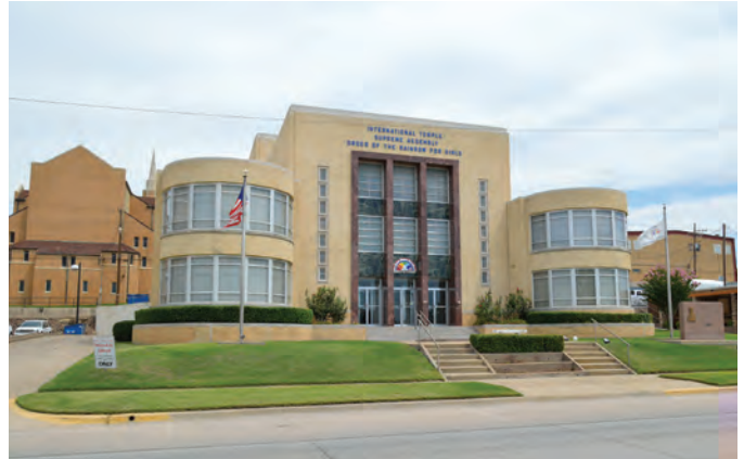
McAlester's Supreme Temple of the International Rainbow for Girls

The re-dedication of McAlester's Rainbow for Girls Supreme Temple was held to celebrate the building being listed on the National Register of Historic Places by the United States Department of the Interior. The Rainbow for Girls Supreme Temple received a certificate signed by Oklahoma Governor Mary Fallin from the Oklahoma Historical Society commemorating its National Register listing. The building at 315 E. Carl Albert Parkway is significant in the area of social history as the world headquarters for the Order of the Rainbow for Girls as well as for its representation of mid-20th-century, Moderne architecture. Bradford said "it's a tremendous honor to be recognized by the Society because the building itself has so much