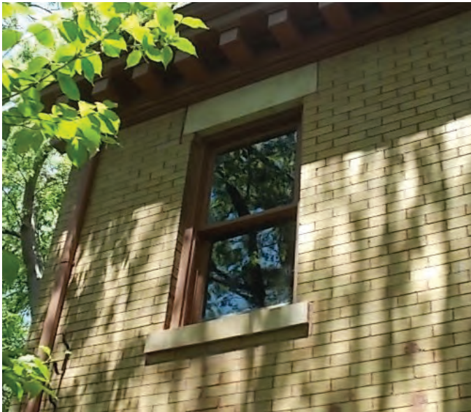
A view of my window