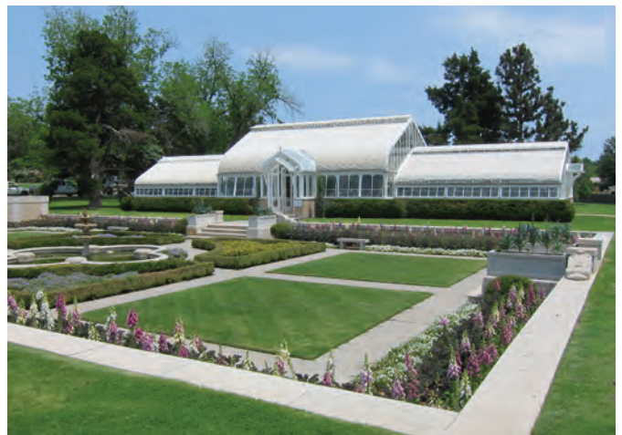
Woodward Park Gardens Historic District, Tulsa, Photo: SHPO