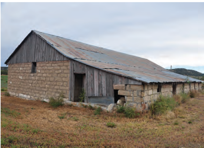
Henley Barn, near Kenton

Surveys are performed to identify, record, and evaluate resources for NRHP eligibility and aid in local/statewide planning efforts. All survey information is incorporated into the OLI.