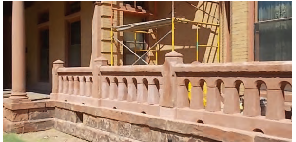
Ballustrades before (top) and after (bottom), Photos: Lisa Escalon