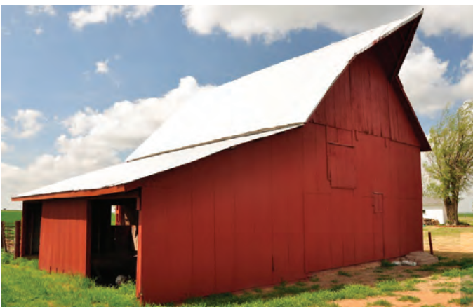
Resource # 268, near Hinton