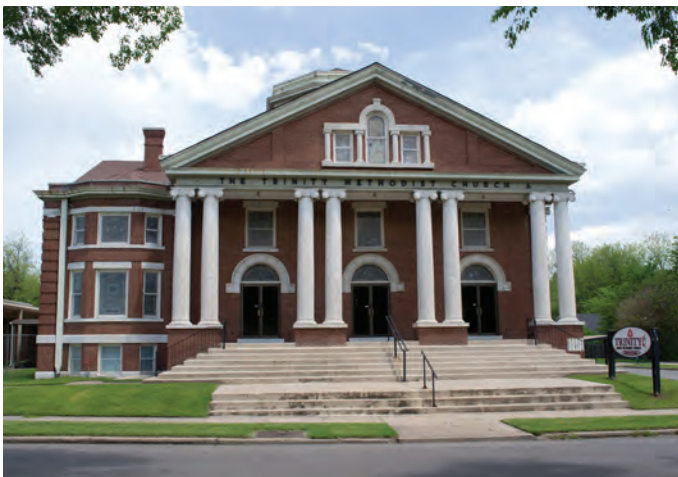
First Methodist Episcopal Church, Muskogee