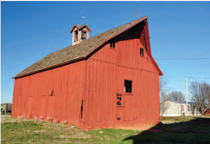
Louis Geischen Horse Barn, near Orlando

The places that tell the stories of Oklahoma's people are found across the landscape and are documented in the Oklahoma Landmarks Inventory (OLI) and the National Register of Historic Places (NHRP). Through its long-standing partnership with Oklahoma State University (OSU), the State Historic Preservation Office (SHPO) will begin two survey projects this fall to add to our collection of these important resources, and the work will be completed by September 2014.