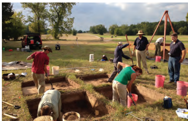
Archaeologists digging excavation units at Spiro Mounds.

During October, museums, nonprofit organizations, government agencies, and individual archaeologists will share information about the special places that tell the story of the state's distant past in celebration of Oklahoma Archaeology Month. Cosponsors of the second annual statewide observance include the Oklahoma Anthropological Society; Oklahoma Archaeological Survey; Oklahoma Historical Society, State Historic Preservation Office; and the University of Oklahoma Anthropology Department.