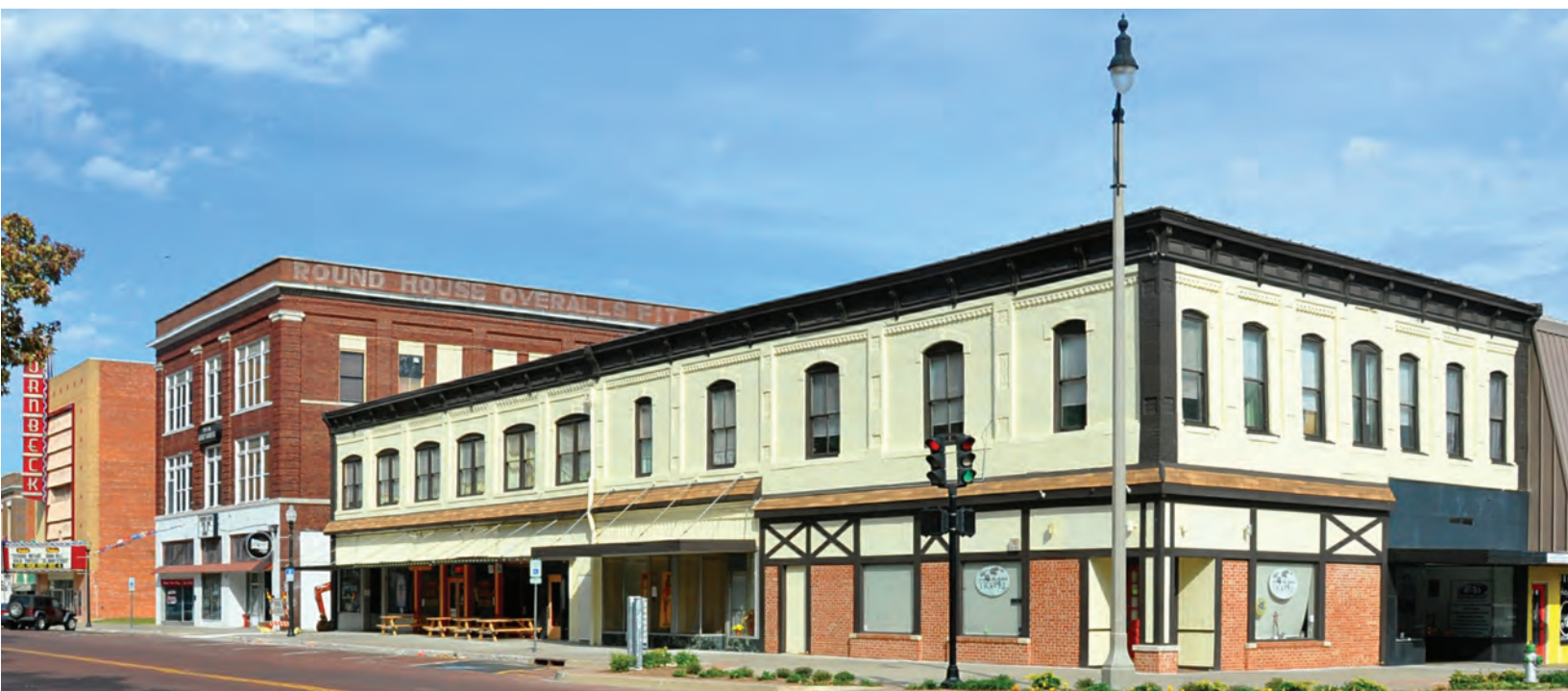
102 E. Main.