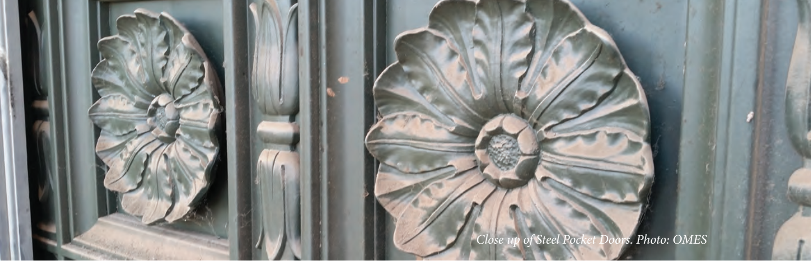
Close up of Steel Pocket Doors.