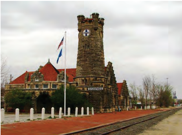
Santa Fe Depot.

Historic Shawnee Alliance, Inc. (HSA) recently formed a 501 (c)(3) to assist downtown building owners to preserve and improve their historic structures, attract new businesses, encourage downtown living, promote arts and entertainment and make improvements to enhance the quality of life for Shawnee citizens.