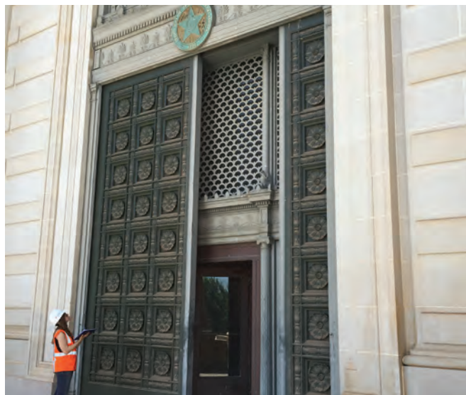
Steel Pocket Doors.

The steel pocket doors are original to the building and it is said they were added as a defense mechanism. The State Capitol was built during World War I and it was thought there would be a need to defend the building from an attack if the war happened to arrive on American shores. Thankfully, such a scenario never came to pass. The beautiful steel pocket doors can instead be categorized as one of the many impressive decorative elements on the People's House.