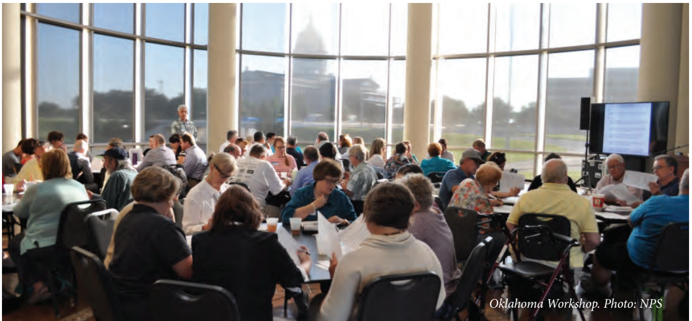
Oklahoma Workshop.