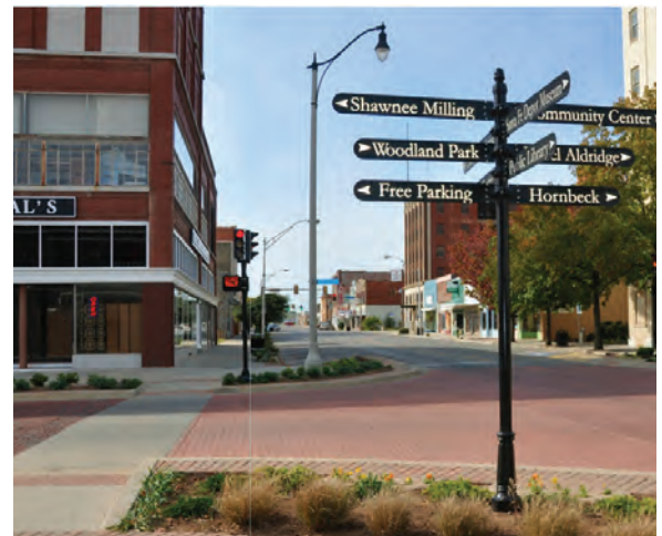
Downtown Shawnee.