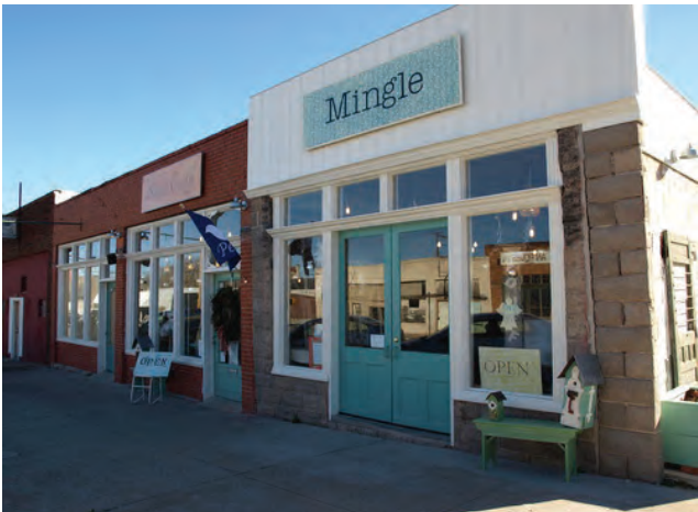
419 E. Main.

Shawnee was selected as one of the first Oklahoma Main Street communities in 1987. The early success of that effort resulted in being designated a Preserve America Community in 2004. Some highlights of that period were the completion of the Phase I Streetscape, establishment of a TIF District, renovation of the Aldrich Hotel and many other façade improvements within the downtown district, culminating in hosting the Statewide Preservation Conference in 2004.