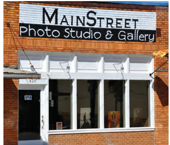
420 E. Main.

Through the years, Shawnee has remained committed to saving and improving their historic downtown. Preservation remains the catalyst to preserving this culturally diverse community. For more on HSA and details on these projects, see www.historic-shawnee.com .