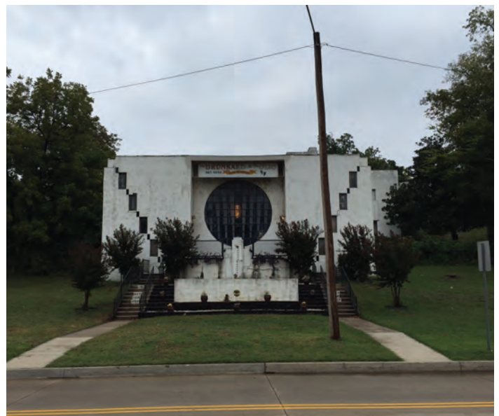
Riverside Studio.

Nomination form is available online at www.preservationok.org or by contacting the POK offices.