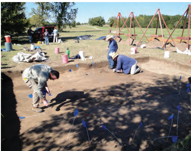
Spiro Mounds.

For more information and to register for the conference, please visit https://okpublicarchaeology.wordpress.com/oklahoma-archaeology-conference/ or email us with questions at OKArchaeology@gmail.com . Be sure to spread the word and share news of the conference with your colleagues and friends. You can also register at the door, but the fee will be higher ($15 for students and $30 for others).