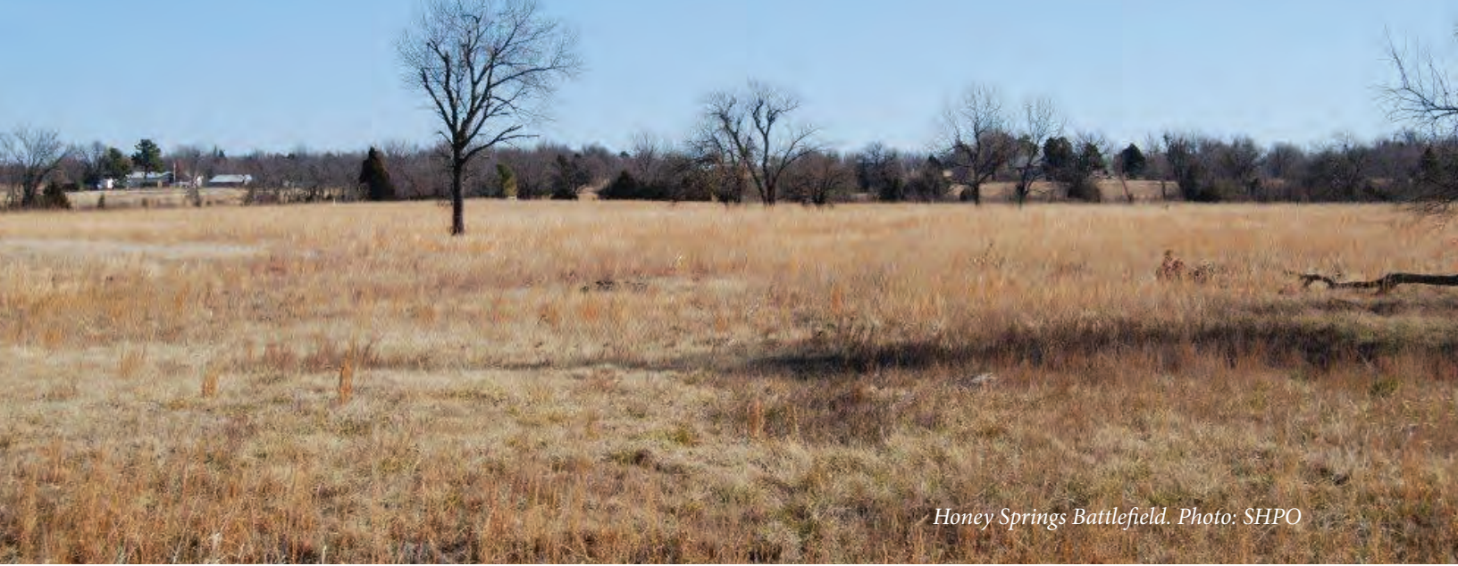
Honey Springs Battlefield.

The Oklahoma Historical Society, State Historic Preservation Office (SHPO), is pleased to announce the schedule for its Fall 2016 workshop series. Each workshop is devoted to one of the SHPO's federal preservation programs and is designed for preservation professionals, government agency representatives, and concerned citizens. The sessions will be held Wednesday, December 7 through Friday, December 9. All sessions will be held in the Classroom, Oklahoma History Center, 800 Nazih Zuhdi Drive, Oklahoma City (just northeast of the State Capitol). The workshops are free and open to the public, but the SHPO requests that you register by 5:00pm, Wednesday, November 25. Space is limited for all sessions and will be reserved on a first-come basis.