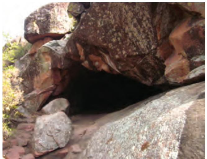
Rock Shelter Site.