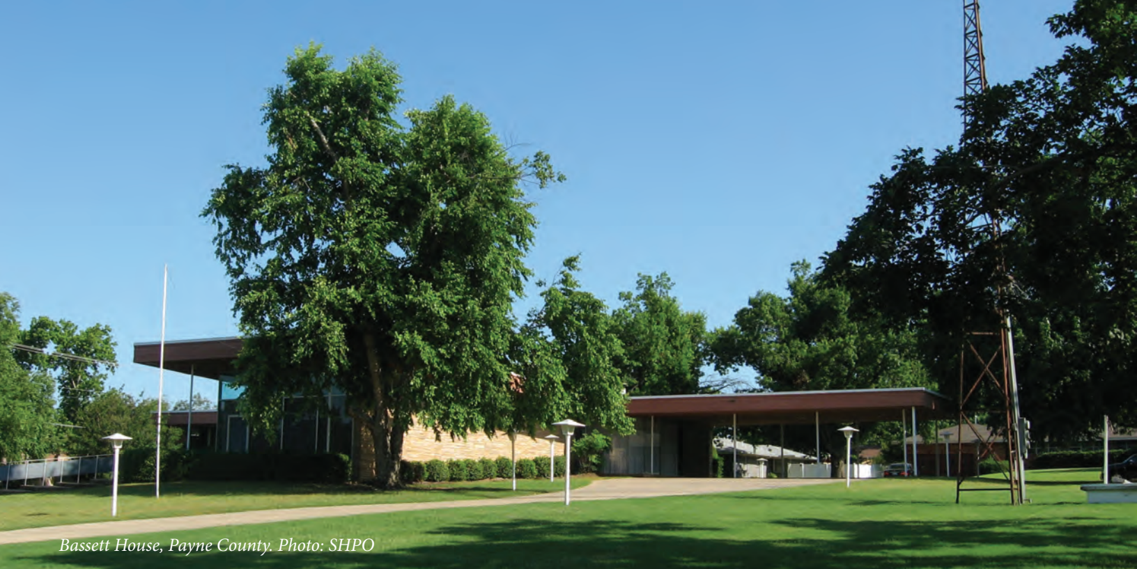
Bassett House, Payne County.