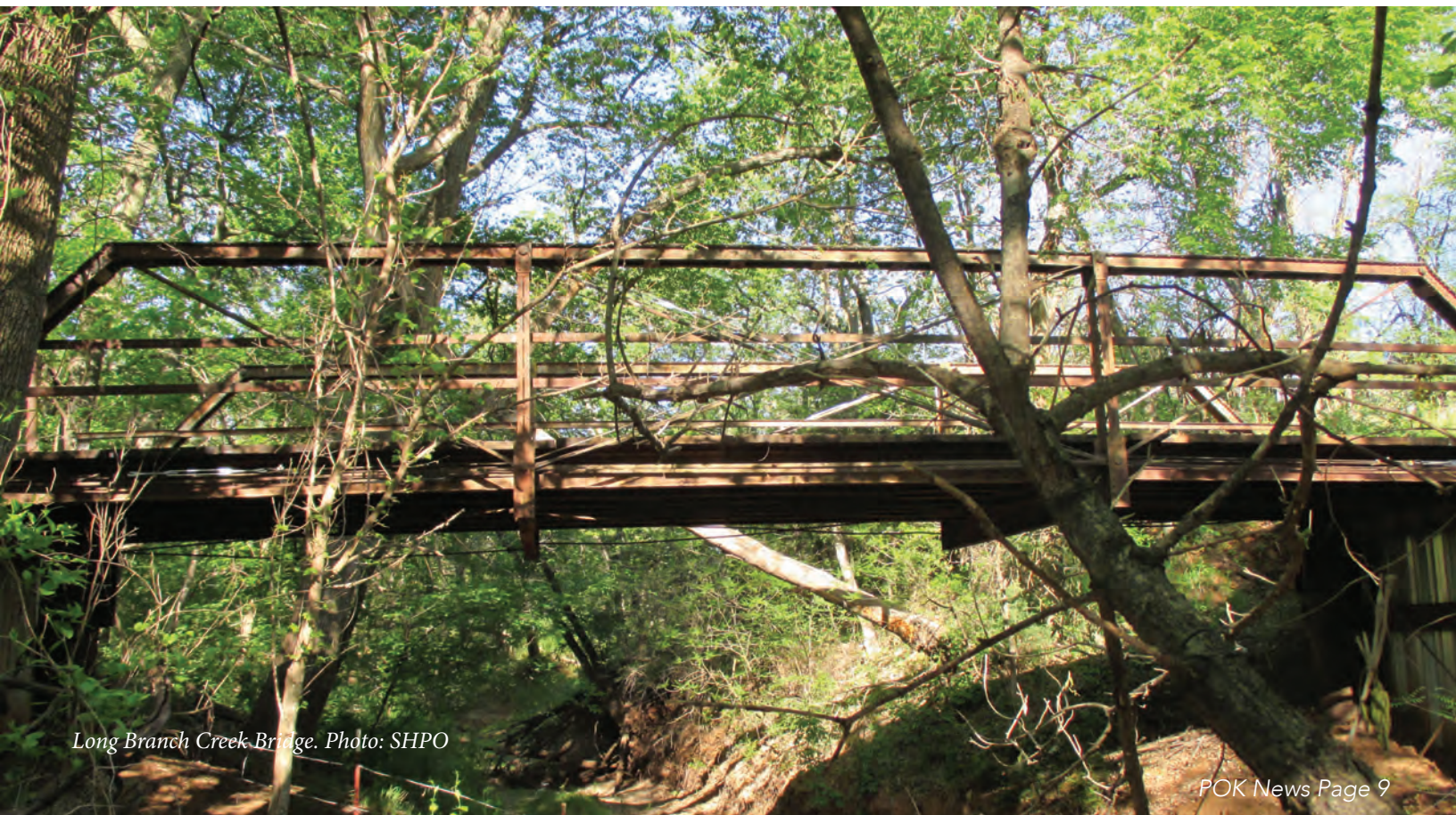
Long Branch Creek Bridge.