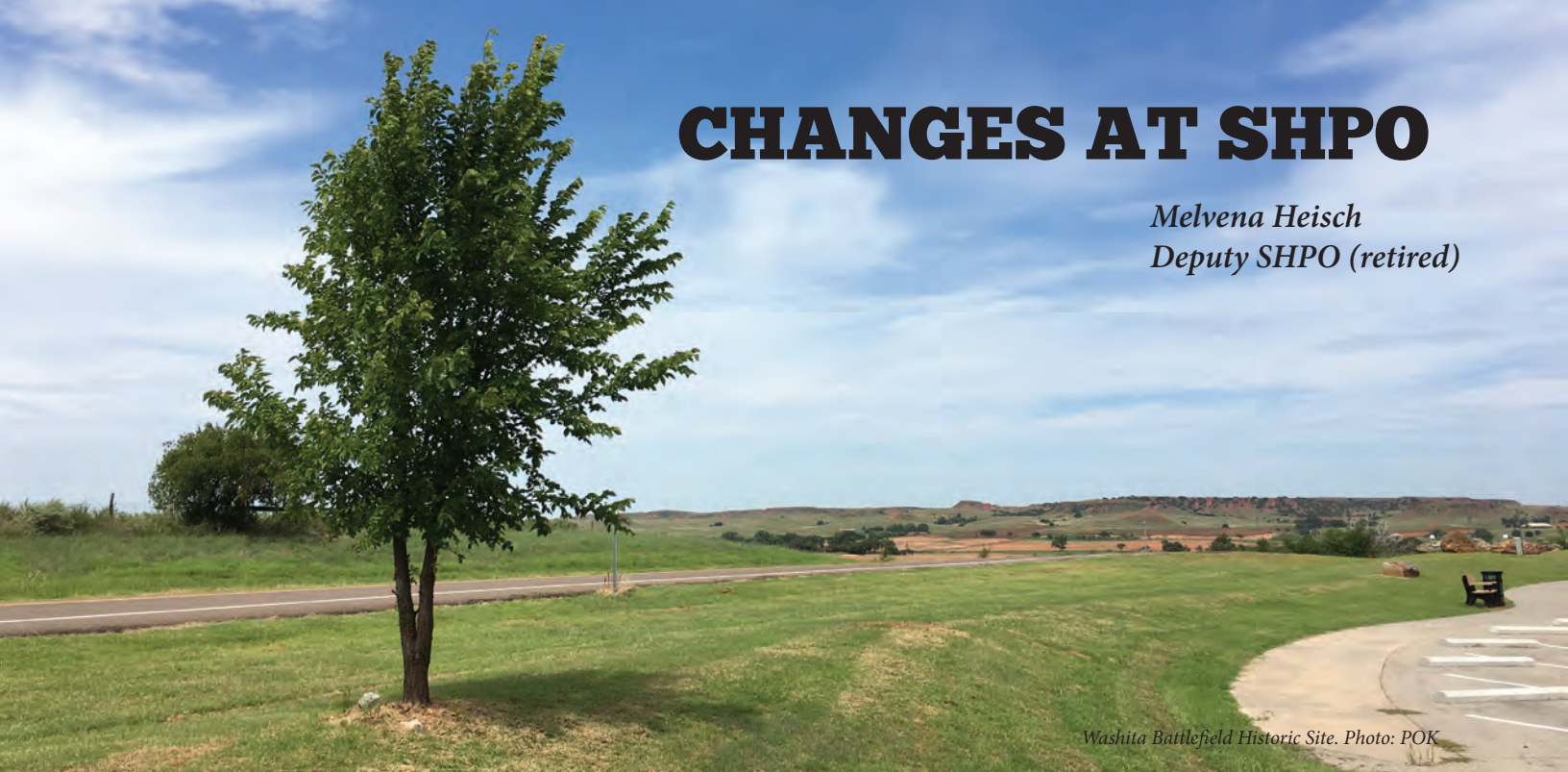
Washita Battlefield Historic Site.

Dear Oklahoma Preservation Friends and Colleagues: