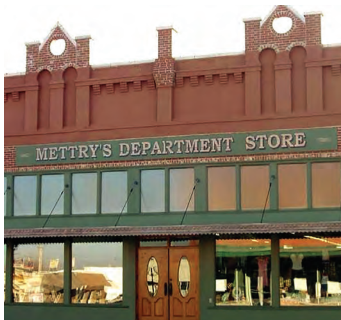
Mettry's Department Store.

As Oklahomans, we have seen 120+ years of building and preservation on our great landscape and we stand ready to face a new, unclear, and challenging future. Our future is one that works to save the architectural legacy of all communities in Oklahoma.