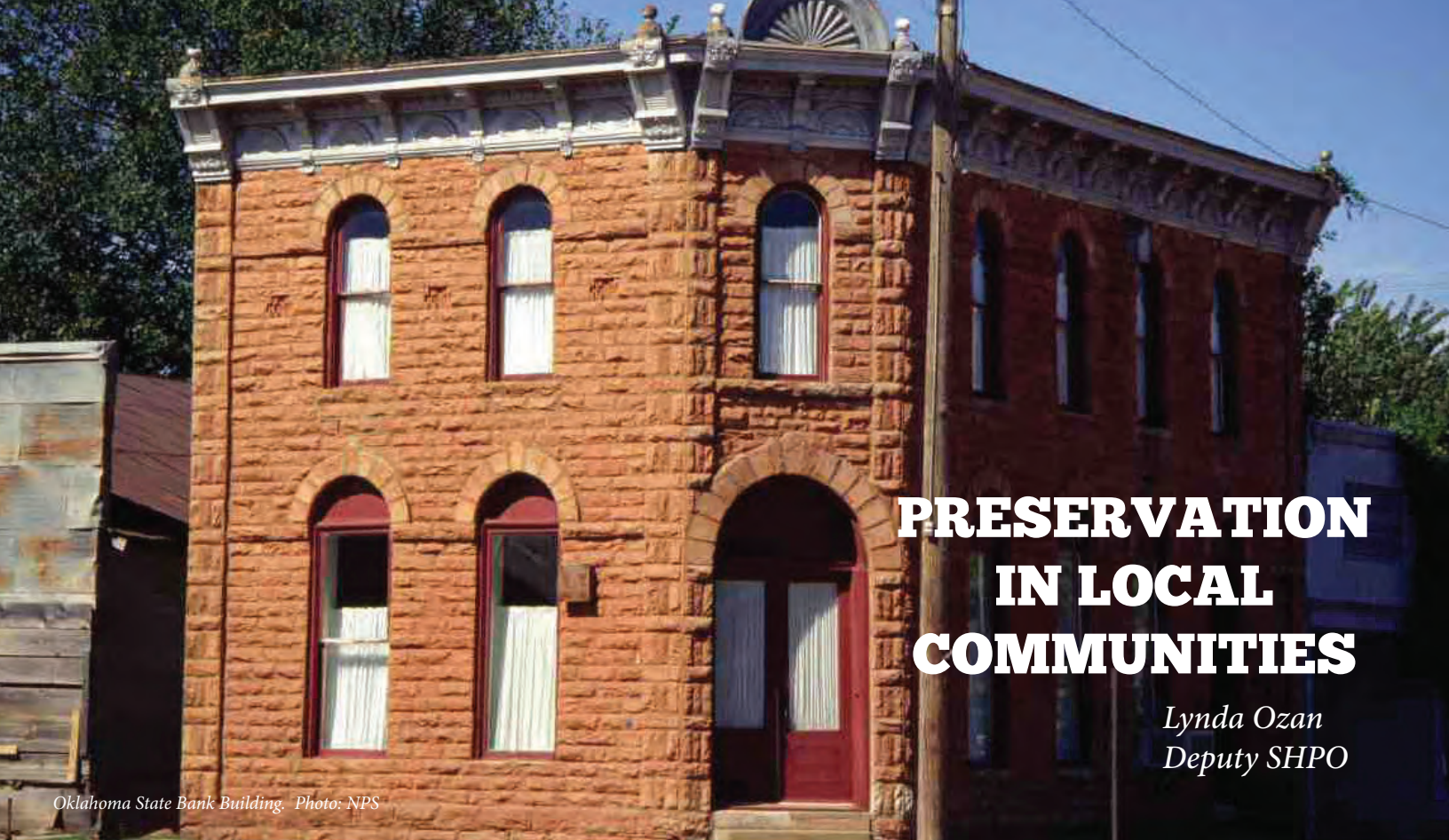
Oklahoma State Bank Building.