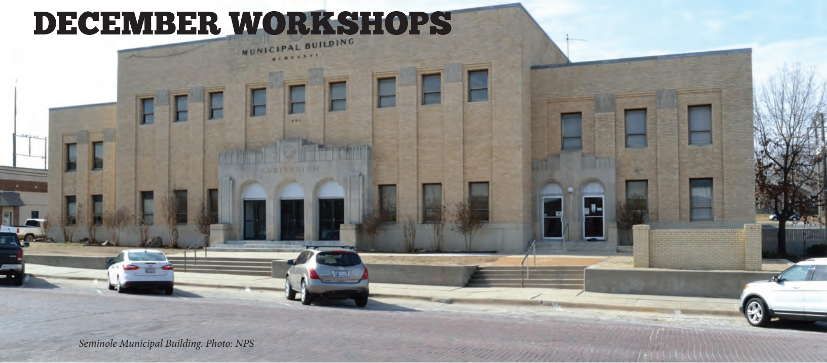
Seminole Municipal Building.

The Oklahoma Historical Society, State Historic Preservation Office (SHPO), announces its schedule for its Fall 2017 workshop series. Each workshop is devoted to one of the SHPO's federal preservation programs and is designed for preservation professionals, government agency representatives, and concerned citizens. The sessions will be held Wednesday, December 7, through Friday, December 9. All sessions will be held in the Classroom, Oklahoma History Center, 800 Nazih Zuhdi Drive, Oklahoma City (just northeast of the State Capitol). The workshops are free and open to the public, but the SHPO requests that you register by 5:00 pm, Wednesday, November 29. Space is limited for all sessions and will be reserved on a first-come basis.