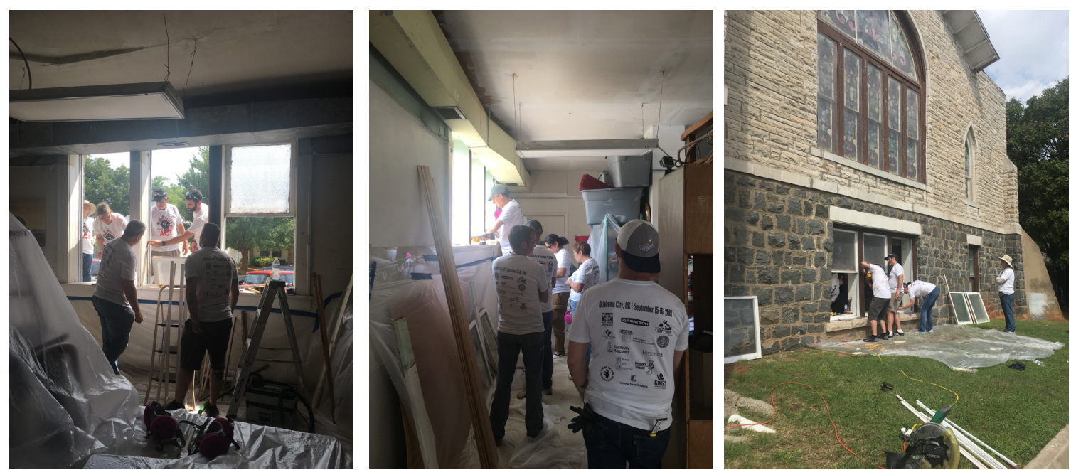
2018 Wood Window Restoration Workshop