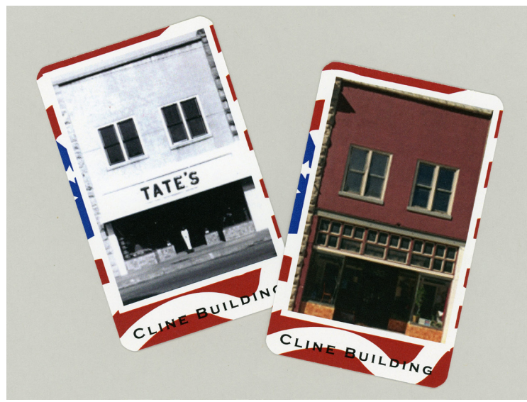
Old Maid Cards, Photo: SHPO