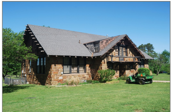
Bacone College Historic District, Muskogee, Muskogee County