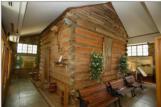
Sequoyah's Cabin, Sallisaw, Sequoyah County

Anyone can prepare a National Register nomination for any property and submit the nomination package to the SHPO. The SHPO reviews and processes all nominations received in accordance with NPS regulations (36 CFR Part 60) and the relevant standards and guidelines. The SHPO encourages individuals preparing National Register nominations to involve property owners in the project and to work with the SHPO to provide accurate information to property owners about the National Register process and their rights in that process.