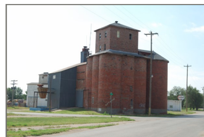
L to R: Public Library of Enid and Garfield County, Enid, Garfield County; Joyce House, Snyder vic., Kiowa County; and Farmer's Federation Elevator, Cherokee, Alfalfa County