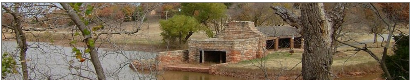
Perry Lake Park, Perry, Noble County

Remember that National Register listing does provide recognition of a property's importance. It helps make the general public and community leaders and decision makers aware of the property, and such increased awareness can cause people to ascribe value to the property. The attitudes of local citizens and officials are key to a successful preservation effort. Additionally, National Register nominations ensure that high quality documentation about listed properties will always be available for use by researchers and the public even if circumstances prevent a property's preservation in place.