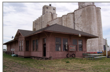
Keel Creek Bridge, Coal County; Rosamund, Tahlequah, Cherokee County; Vici M-K-T Depot, Vici, Dewey County

If a project requires alteration, rehabilitation, removal, demolition, or any other modification of a property that is listed on or eligible for the Register, the federal agency or applicant must then consult with the SHPO to determine whether or not there will be an adverse effect. The majority of projects will have either "no effect" or "no adverse effect" on the historic property, and the project work can proceed as soon as either of these conclusions is reached. The SHPO may issue a "conditional no adverse effect" opinion which means that, if the agency or applicant agrees to make certain changes to the project plans, the work may proceed without further SHPO review. If it is determined that the project will have an "adverse effect" on the property, then the agency must consult with the SHPO to determine how these effects can be eliminated or reduced and mitigated. Guidance about assessment of effect is found in the Council's regulations (36 CFR Part 800.5).