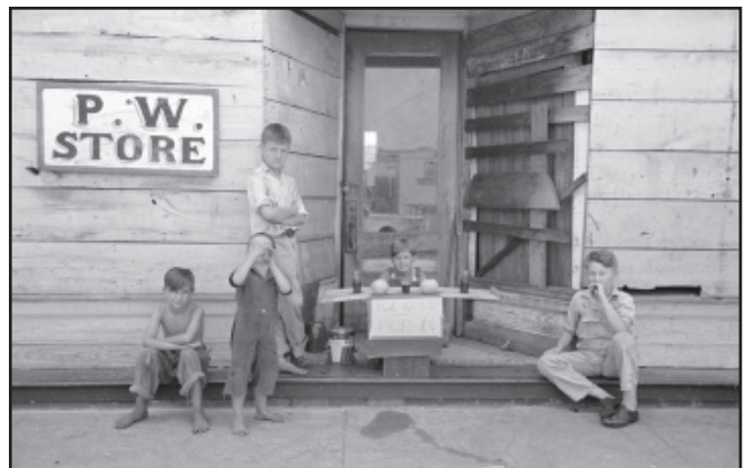
Local children sell soda pop in the farm marketing stand at P.W. Store, Muskogee, July 1939.